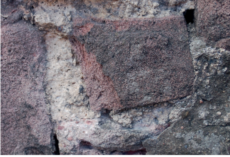
Fig. 10 A lime mortar showing particles of un-slaked lime, characteristic of a hot-mixed lime mortar.

Frost resistance: Hot-mixed lime mortars, whether pure or gauged, seem to have good frost resistance. The reasons for this are not generally well understood, but it may be partly due to the way these mortars are produced: the slaking lime/sand mix produces steam, resulting in an open-pored structure. This seems to have a beneficial effect on the hardened mortar, improving its overall capacity to disperse liquid water and cope with the expansion of freezing water.