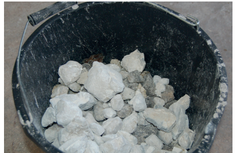
Fig. 2 Lump quicklime.

lime (lime that has already reacted with water to form a putty or a dry hydrate powder) is added to aggregate to form a mortar. Hot-mixed lime mortars have some different properties to mortars prepared from mature lime putty or bagged dry hydrate powdered lime due to the effect of the heat of the reaction, and the high alkalinity of the lime, on the aggregates and other components in the mix.