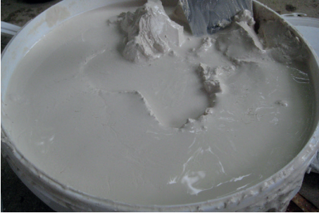
Fig. 6 Mature lime putty.