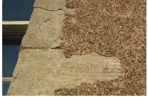
Fig. 11 Weathered lime harling on an early 19th century building in Shetland.

Economy: Quicklime is generally a cheaper product than lime putty, NHLs or other proprietary lime products. Quicklime can more than double in volume during its reaction with water and so less is required for a proportionate mix. Manufacturers and suppliers should be able to provide a figure for the bulk density of their quicklime to enable accurate batching.