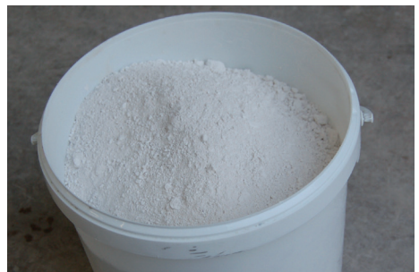
Fig. 4 Powdered quicklime.