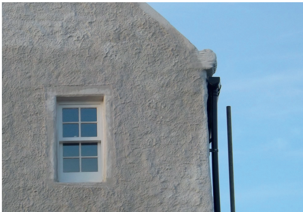
Fig. 12 Modern gauged hot-mixed lime harling on a building in Shetland.