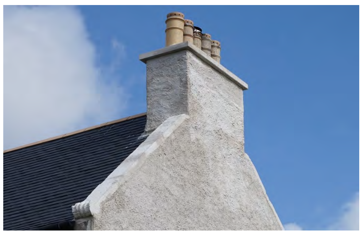
Figure 21.2 Detail of the chimney stack and upper gable, illustrating the harling and the limewash, the latter having been taken over the stone skews.