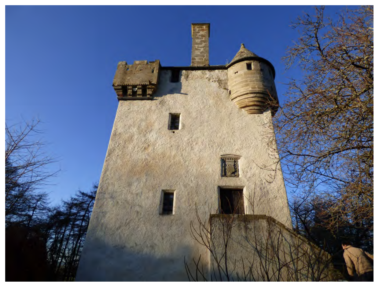
Figure 16.1 Front elevation viewed from the south-east.

The tower was re-harled in 2010 with a hydraulic hot-mixed harling, and also limewashed. Unlike most other projects within this report, the quicklime had a hydraulic component. This type of material is hard to procure but the contractor had access to supplies. The limewash was made from an NHL2 and was not pigmented; the warm colouring is the natural colour of the lime and its constituent minerals.