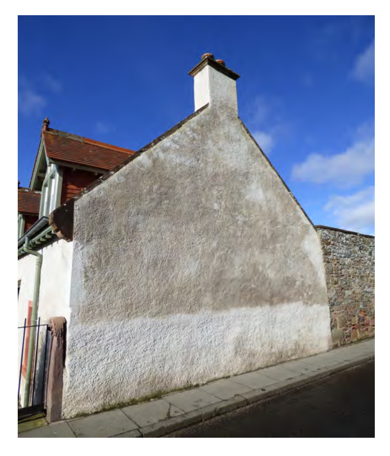
Figure 20.3 View of the east gable, showing the effects of a recent wall coating at lower levels.