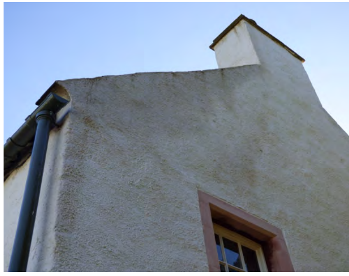
Figure 19.2 Evidence of rainwater wetting the wall below the north skew on the west gable, where water is running off the skew copes onto the gable.

The north elevation also shows evidence of the walls being damp, particularly adjacent to the paved walkway. Here the walls appear to be affected by rising damp; splash from the paving and the run-off is affecting the wall below the window cills. The harl texture varies slightly with some areas coarser than others.