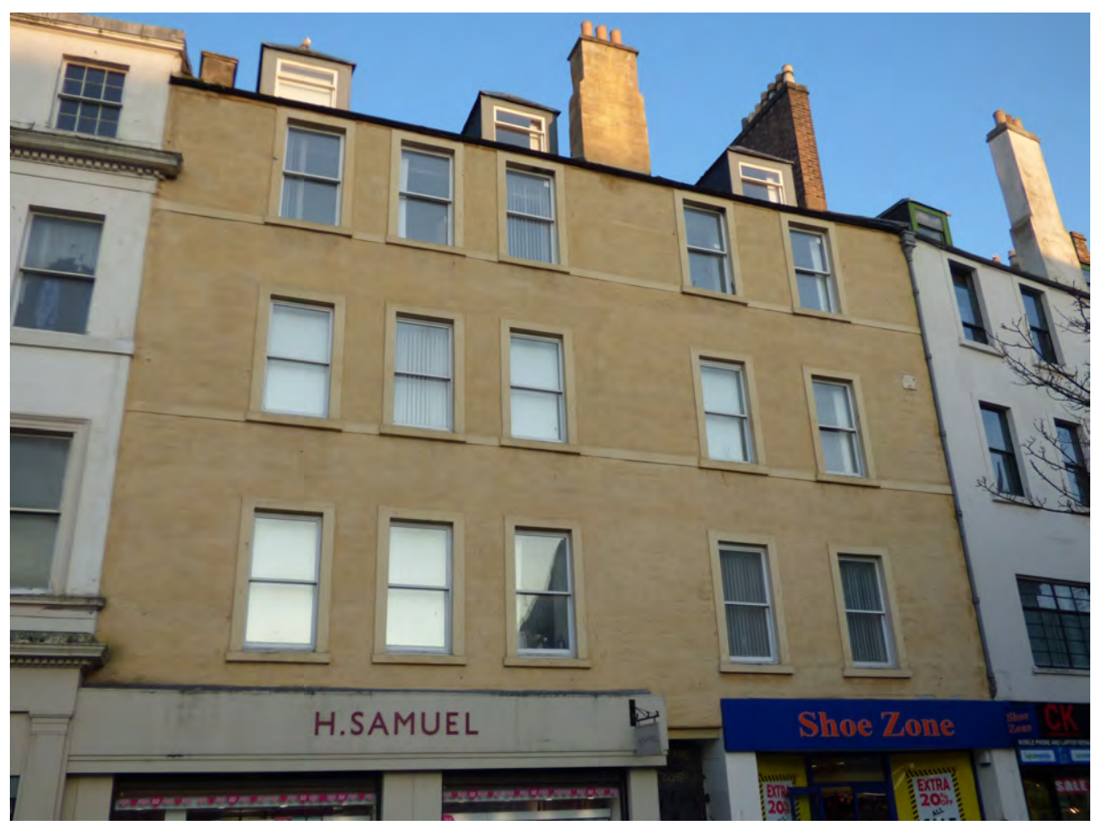
Figure 6.1 Front elevation showing the generally good condition of the harling.

This is a late 19th-century masonry building with a thin, lime harl applied over the stonework. The harl is an NHL gauged hot-mixed mortar and is sufficiently light to permit the shape of the underlying masonry stones to reflect through it. Yellow coloured limewash was painted over a finely textured finish. The works were carried out in the autumn and winter of 2000, normally not customary months for lime work. The works were supported by Dundee Council's Facade Enhancement Grant Scheme. The harl appears to be thinly coated, possibly displaying a dragged finish to enhance texture and impart a uniform appearance across the elevation.