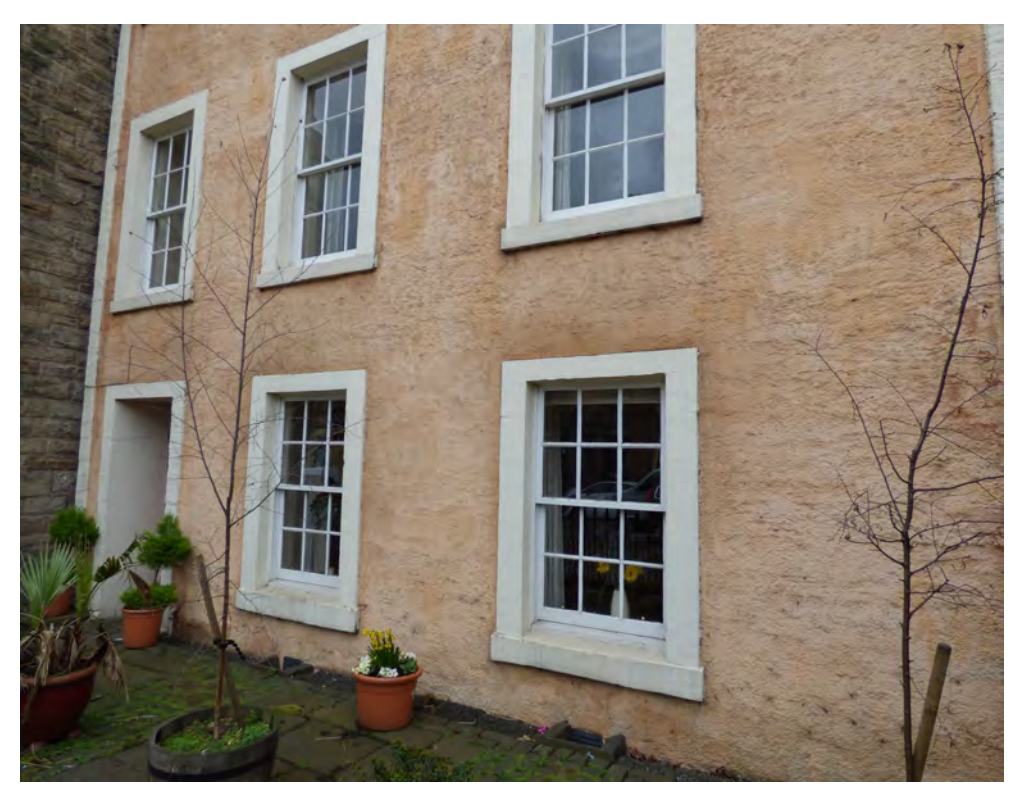
Figure 23.2 General view of the ground floor elevation, showing intact harl.