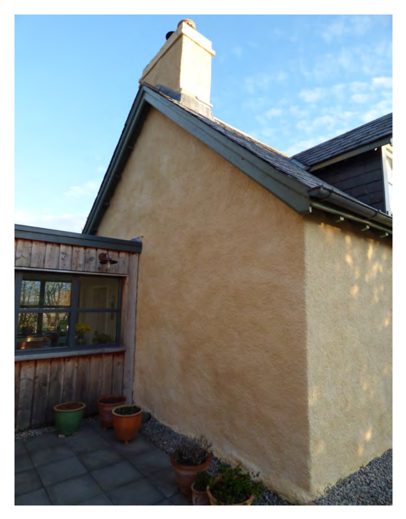
Figure 14.3 West gable, showing the natural variation in colour that is achieved with a well burnished pigmented limewash.