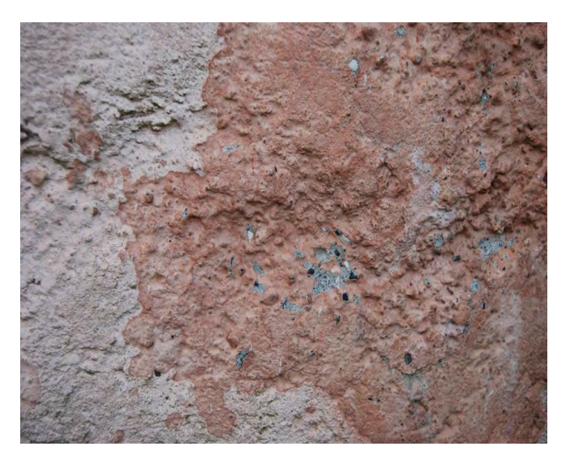
Figure 22.3 Detail of harling and limewash, with localised area of weathering/decay exposing underlying harl. The shell fragments can be seen in the harl finish.