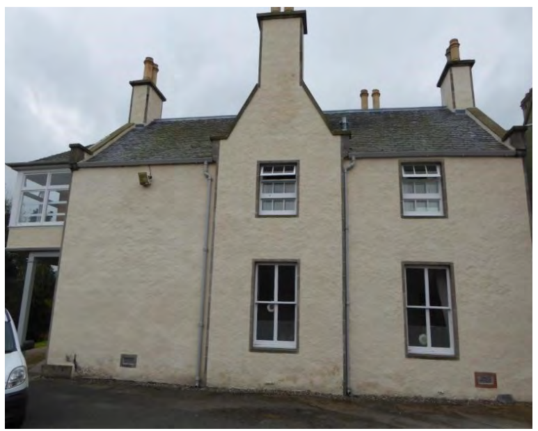
Figure 1.3 Rear elevation, the harl and limewash all sound, with the exception of rising damp and some mechanical damage at ground level.