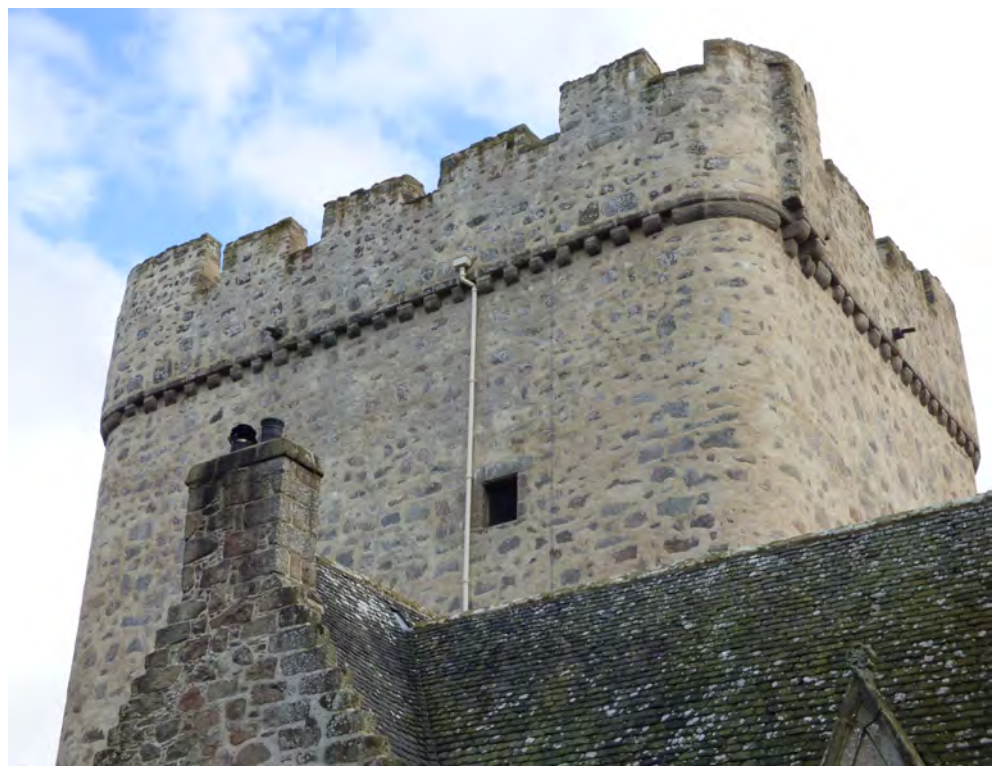
Figure 4.3 The east elevation of the tower, where the pointing appears to be performing well.