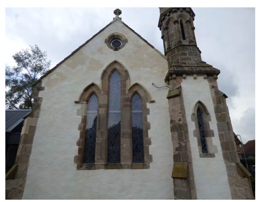
Figure 2.2 View of the west gable with bell tower. The harl and limewash are well finished and appear sound at this time. The limewash at upper levels shows the effect of wetting drying cycles.