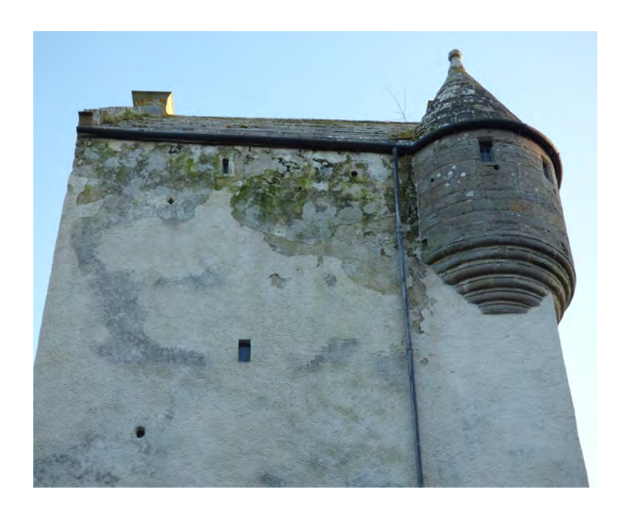
Figure 16.2 Extensive failure of the harling on the upper part of the northwest elevation, where there is total saturation of the wall head, probably due to poorly detailed rhones and a blocked downpipe.

The harling and limewash finish to the south-west elevation appear visually sound, with only minor and localised disruption of the harl observed, again at the wall head and ground level. The north-east elevation shows the most extensive failure of the harling. The damage appears to be mostly due to water drainage onto the wall fabric, with saturation and frost damage. Most of the disruption observed appears to be due to detailing issues and the malfunction of rainwater goods at high level.