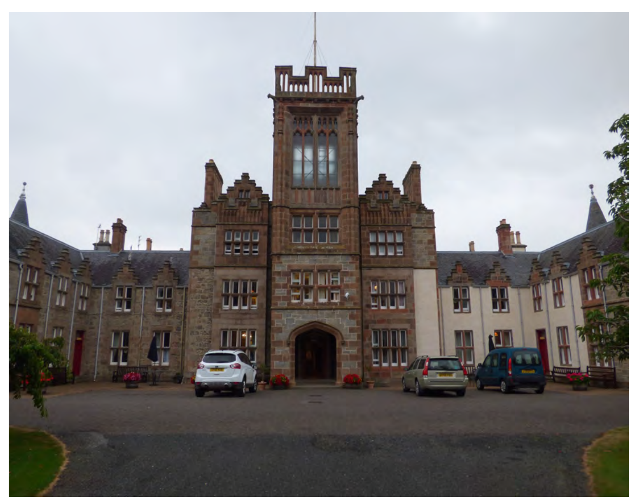
Figure 1.1 Main entrance, south-facing elevation.

The work on the hospital was supported by a grant from Historic Environment Scotland. The building has lime harling to the front, gable (side elevation), rear elevation (east side) and rear recess. The harling is an NHL gauged hot-mixed lime mortar, with traditional hand-cast finish throughout, and is consistent in terms of its texture and general appearance. It is finished with a limewash which also seems consistent in terms of its colouring. The harling appears to be well bonded to its substrate with no cracking observed, and is neatly feathered into the stone dressings. There is little evidence of any erosion or disruption, even below the window cills, where the harl is slightly proud of the stone. Locally, at ground level terminations, the harl is affected, though not significantly, by rising damp. No bossed harl was detected at these locations. Minor algae and water staining is apparent on the gable and rear elevations, with this particularly noticeable within the "L shaped" recess on the rear elevation, where air flow is restricted.