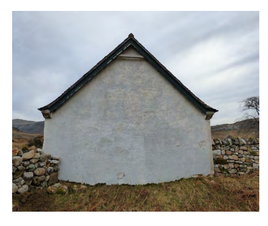
Figure 12.3 The lime harling on the very exposed west gable remains in good condition. There is some loss of limewash, which is to be expected due to the exposed nature of the site.