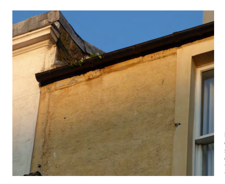
Figure 6.2 West side of elevation at roof level, showing some localised disruption of the harl from running water due to a blocked rhone.

chimney stack. However, visually the harl appears to be in generally good condition despite having not been limewashed since 2000. There is some staining at high level due to rhones that have become full of debris. While the limewash is in good condition, it must be remembered that this is a drier part of Scotland and a sheltered urban location.