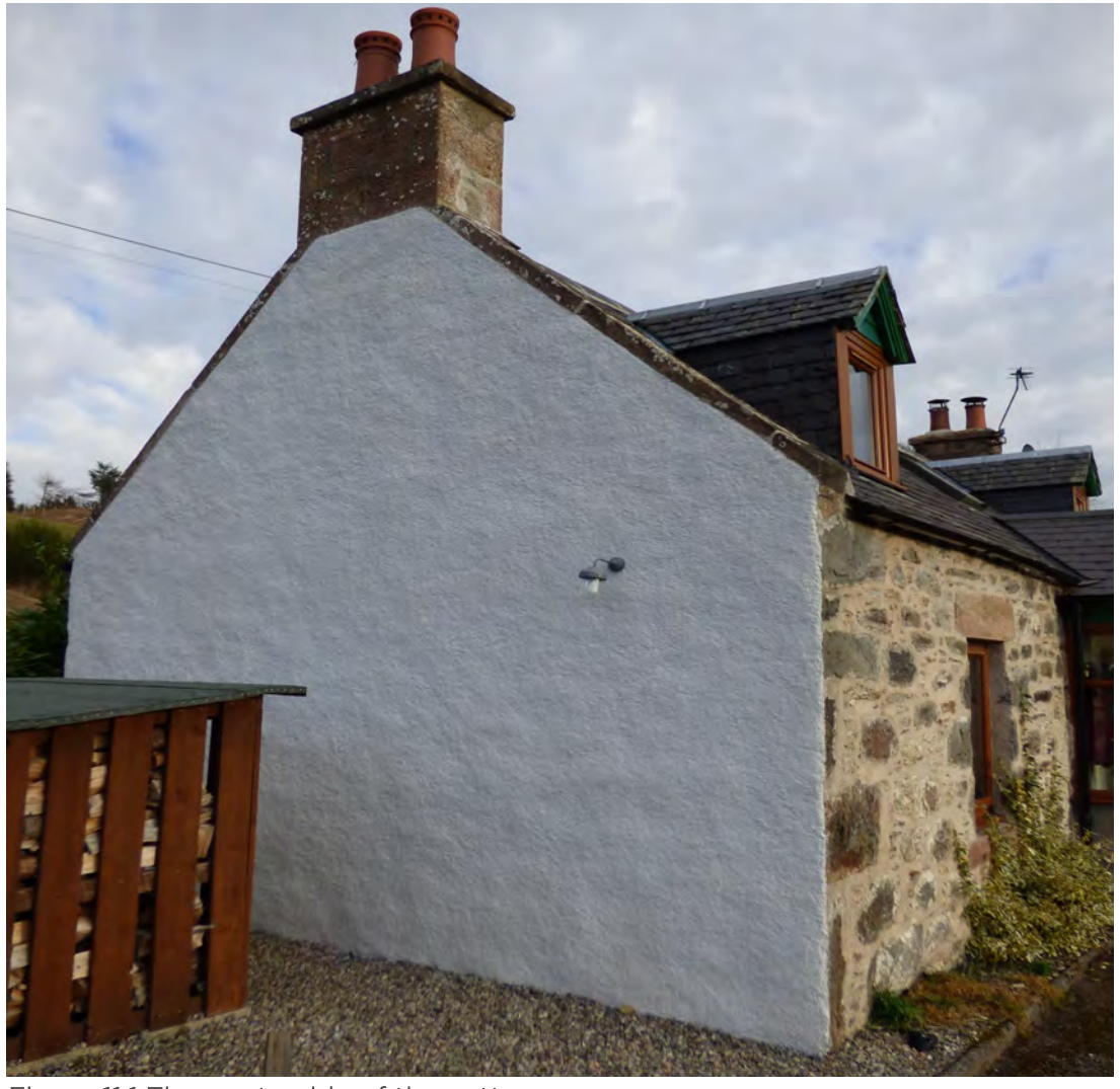
Figure 11.1 The west gable of the cottage.

The gable of this 19th-century cottage was harled with a traditional hand-cast finish, in an NHL gauged hot-mixed mortar. The high points of the harl have been lightly pressed back with a float, and finished with a white (uncoloured) limewash. During the works, care was taken to ensure that the joints in the skew copes were pointed. The area around the base of the wall has been graded and covered with gravel.