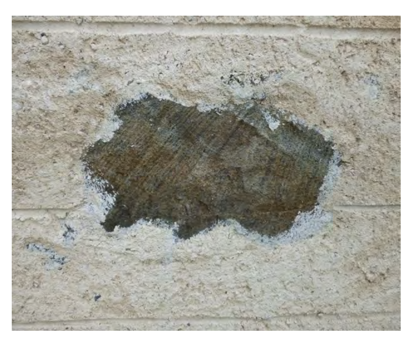
Figure 13.3 Close-up of one stone showing the mortar feathered over the edges of the stone, both effectively flattening the wall surface and displaying good adhesion to the masonry.