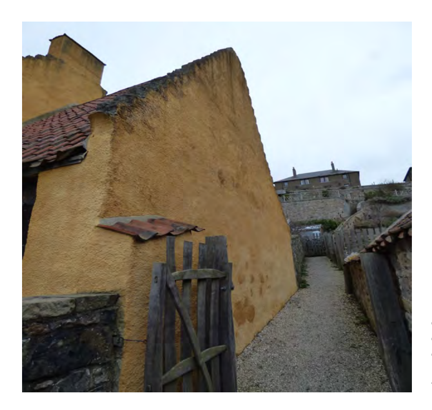
Figure 10.2 View of the east gable of the east extension. Staining at the crow steps is clear, as is blotching from salts within the wall lower down.

At high level, there is minor staining and algae growth on the harling and limewash on the chimneys and crow steps. This is due to water run-off as there is no water shedding detail. In addition there is damage from the passage of water through eroded mortar joints at both the crow steps and chimney copes. It was noted that on all elevations the harl was terminated approximately 30-50mm above ground level, which seems to have limited the impact of ground water absorption into the harl and reduced the impact of splash back from the surrounding hard paving.