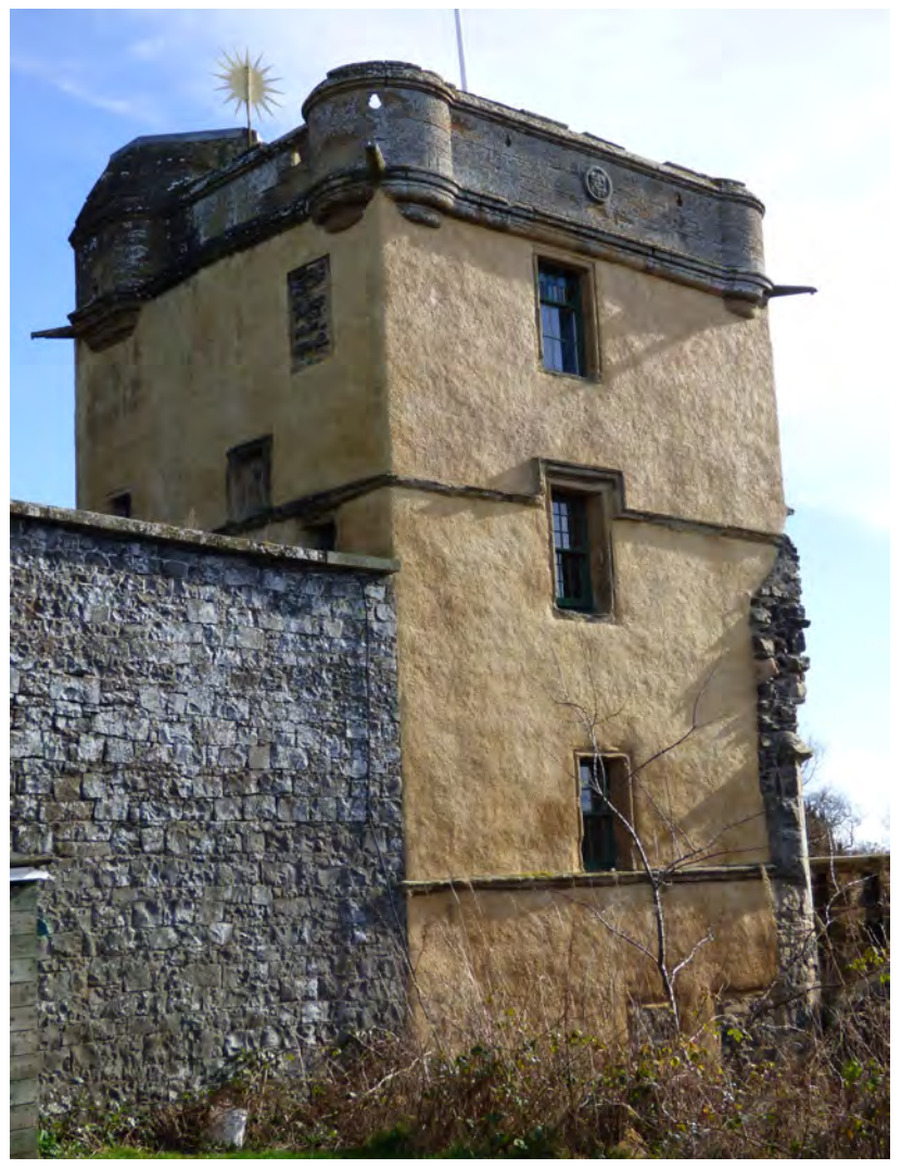
Figure 9.1 View of the west elevation of the tower, from the north-west, showing the slight colour variation in the limewash.

Client: Monimail Tower Preservation Trust