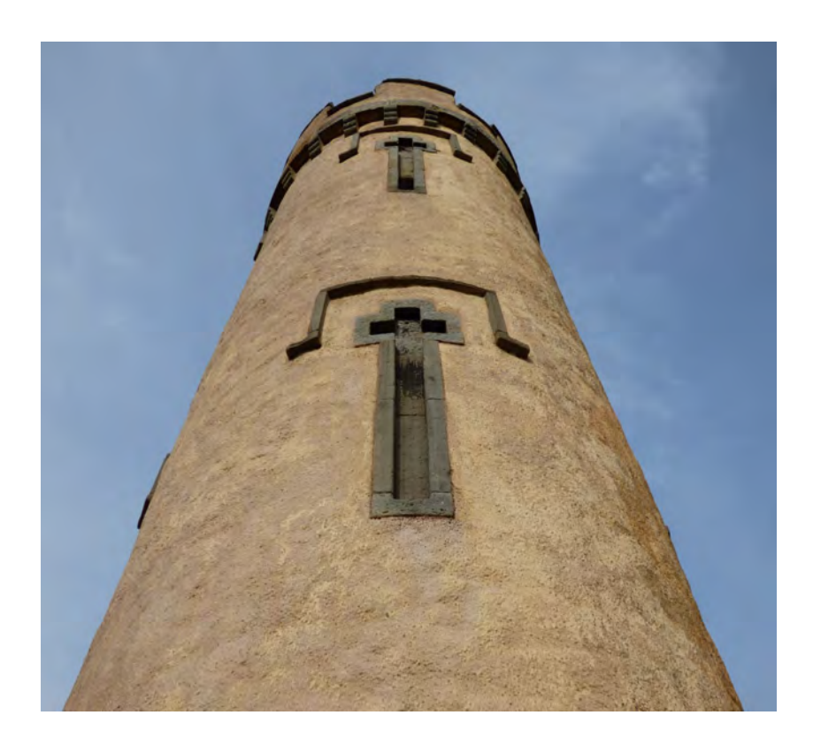
Figure 24.2 View of the upper part of the east elevation showing the weathering and the discolouration of the limewash on the north (right) side of the tower. This side has the most colour variation.

The harling still appears very robust given the height of the structure and its exposed location. It has performed well, and the weathering and erosion is principally restricted to the limewash.