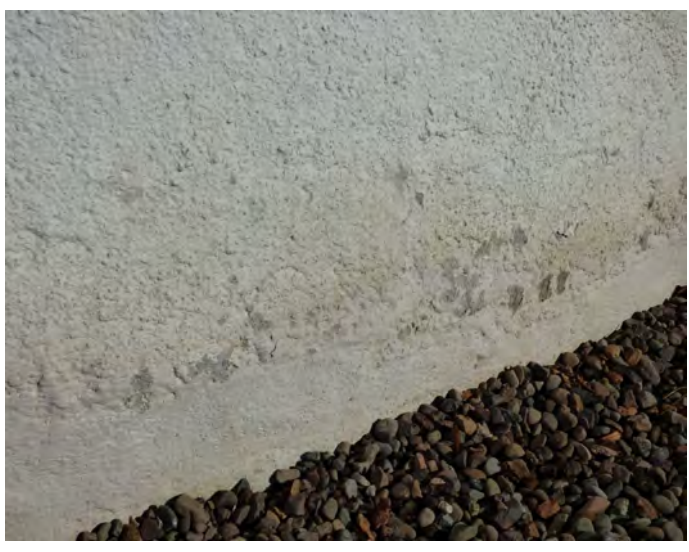
Figure 19.4 Localised spalling at low level in this area of repair.