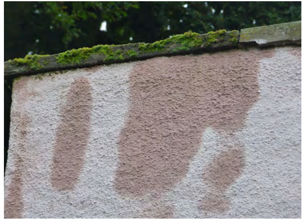
Figure 18.4 Close-up of the copes on the north elevation, east side, supporting moss and algae, demonstrating that they are holding moisture. The affected copes also display localised loss of fabric. An open joint can be seen in the cope, shown in the upper right side of the image. Water is draining through the open joint, flowing along the wall head below the cope and draining down over the harl below. There is the additional possibility that moisture is accessing the wall head at this location and wetting the wall behind the harl.