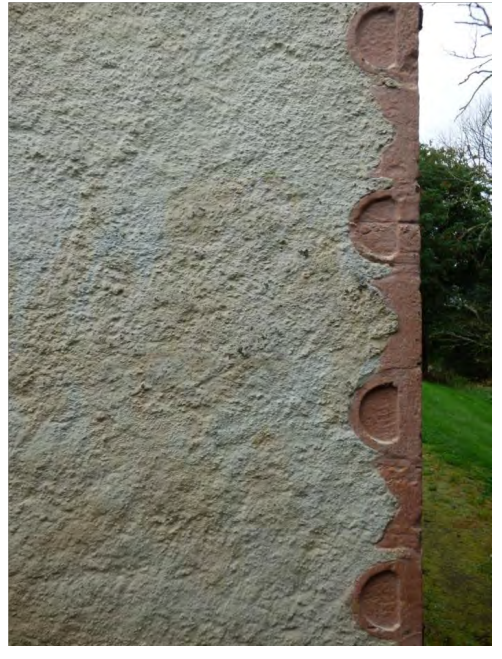
Figure 15.3. The east corner showing the well feathered junction with the sandstone quoins.