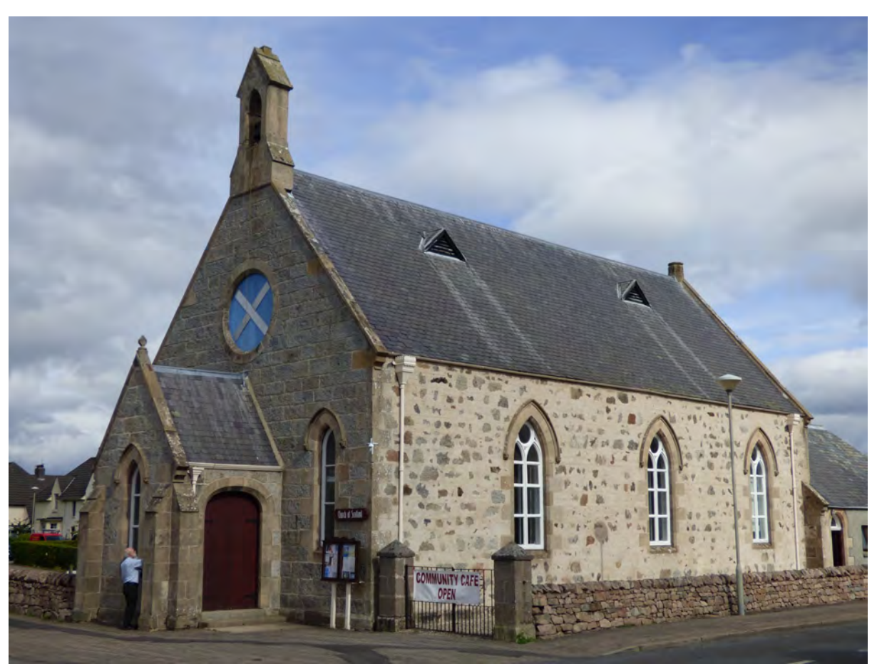
Figure 13.1 General view from the south-west.

Date of works: c.2004 Client: Church of Scotland