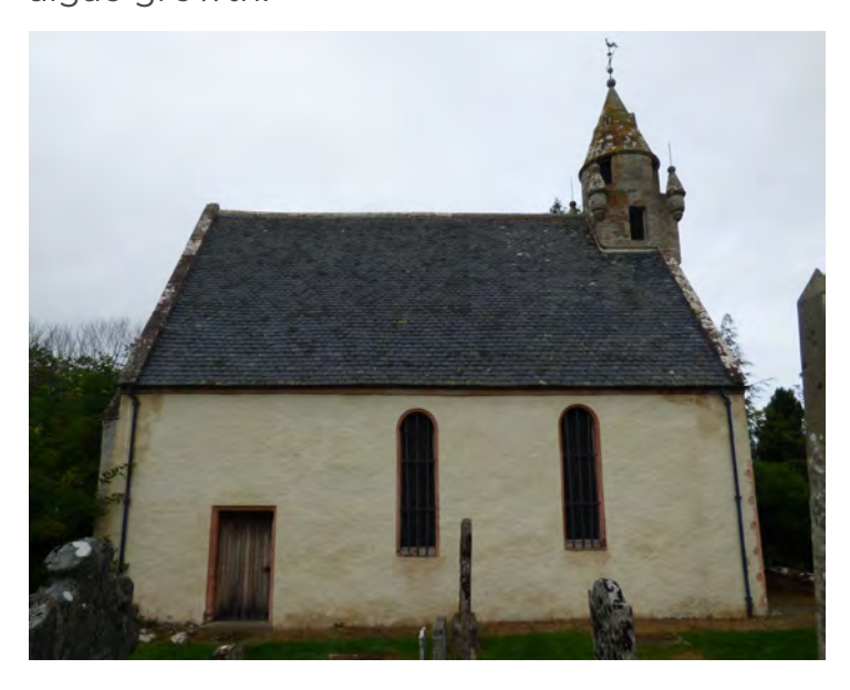
Figure 15.2 South elevation, showing the staining from water run-off below the cills and the damage from the overflowing of the rhones at the wall head.

The east gable has some staining to the limewash and harling due to water run-off at the skews and from the step in the bell tower, but no loss or decay of the harling itself was noted. The north elevation is generally sound although there are small disrupted patches of harl, their shape suggests localised physical impact damage. Where the surface of harling is broken, the mortar is relatively soft and friable but intact. In the north-west corner there is evidence of water run-off from the skew. This has caused the limewash to be stripped, however, the harling appears intact. Likewise, on the west gable the harling and the limewash are in good condition even through there is evidence of water run-off from the skew. The skew has algae growth.