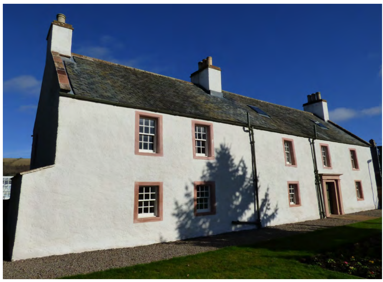
Figure 19.1 View of the front elevation from the south-west.

The harling is a traditional hand-cast finish throughout, finished with a limewash. These are both relatively consistent in appearance across the external walls. The harling is an NHL gauged hot-mixed mortar and limewash made on site from freshly slaked quicklime, applied whilst hot/warm. The harling appears to be well bonded to its rubble stone substrate with no visible cracking observed and, except for the details below, it is doing well.