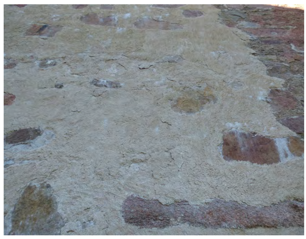
Figure 4.4 Section of pointing on the west wall, where scaling mortar and leaching of lime were observed. This example is directly below one of the parapet water spouts and adjacent to a large section of retained cement based pointing work.