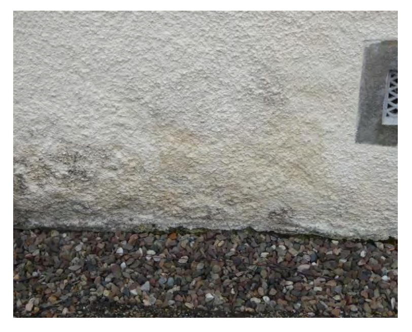
Figure 1.4 The harl at ground level on the rear elevation, showing some staining from rising damp, however, it remains well bonded.