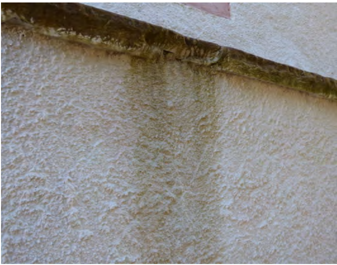
Figure 19.3 Staining of the harl of the stepped extension on the west gable, where the drip detailing is damaged or insufficient.