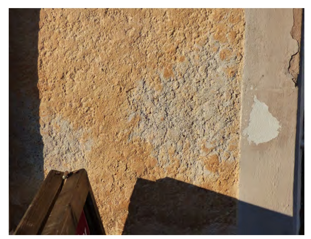
Figure 8.3. West side of the facade, at low level, where damage to the surface is evident. There has also been localised loss of the finish coat and limewash to the window dressing of the westernmost window.