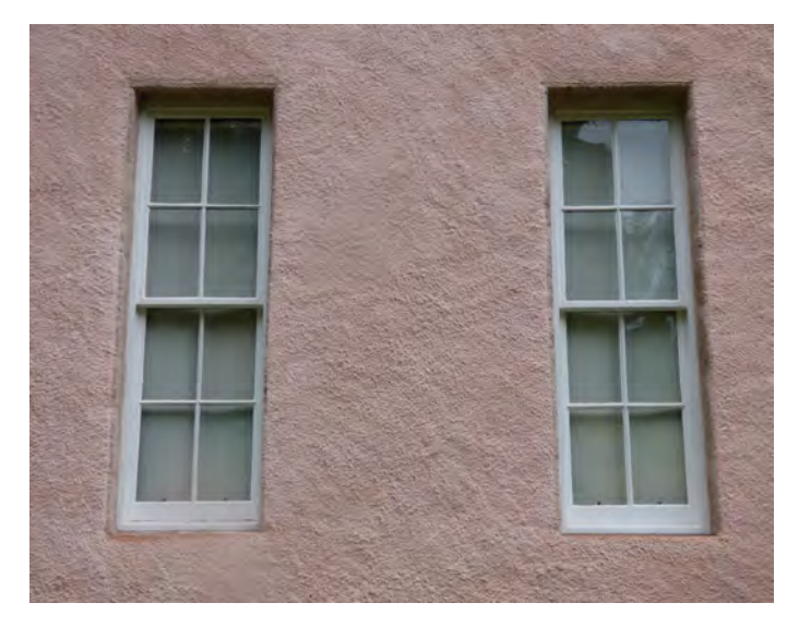
Figure 3.2 View of an area of wall, at first floor level on the west elevation, where the harl and limewash appear sound. No discolouration or erosion was detected at the cills, as is common below large windows where water sheds faster.

Localised patch repairs and re-limewashing were observed at ground level. In an attempt to address erosion and pitting of the ground surface, granite sets have been laid. These have resulted in splash back affecting the harl at ground level.