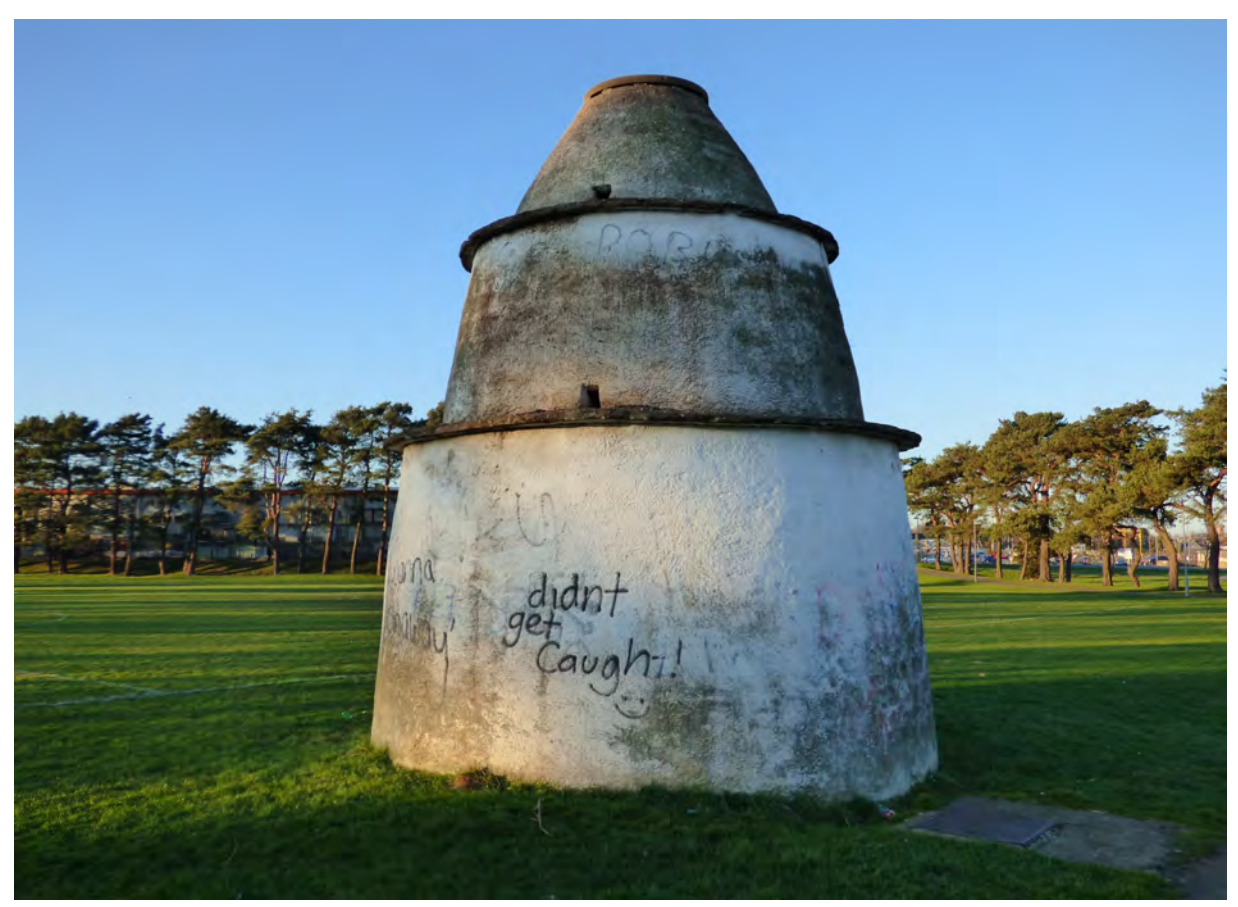
Figure 17.1 South side of the doocot, with intact harl, viewed from the south.

Date of works: c.1999 Client: Moray Council