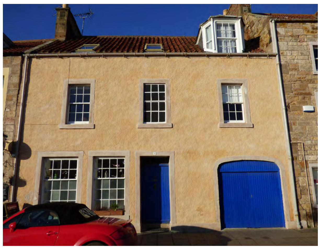
Figure 8.1 Front (south-east) elevation, showing the uniform appearance of the limewashed harl over the full elevation.

The building's lime harl appears to be a traditional hand-cast finish and is an NHL gauged hot-mixed mortar. The harl finish has been lightly pushed back with a float to impart a flatter overall texture to the wall surface. The harl is painted with a pigmented limewash.