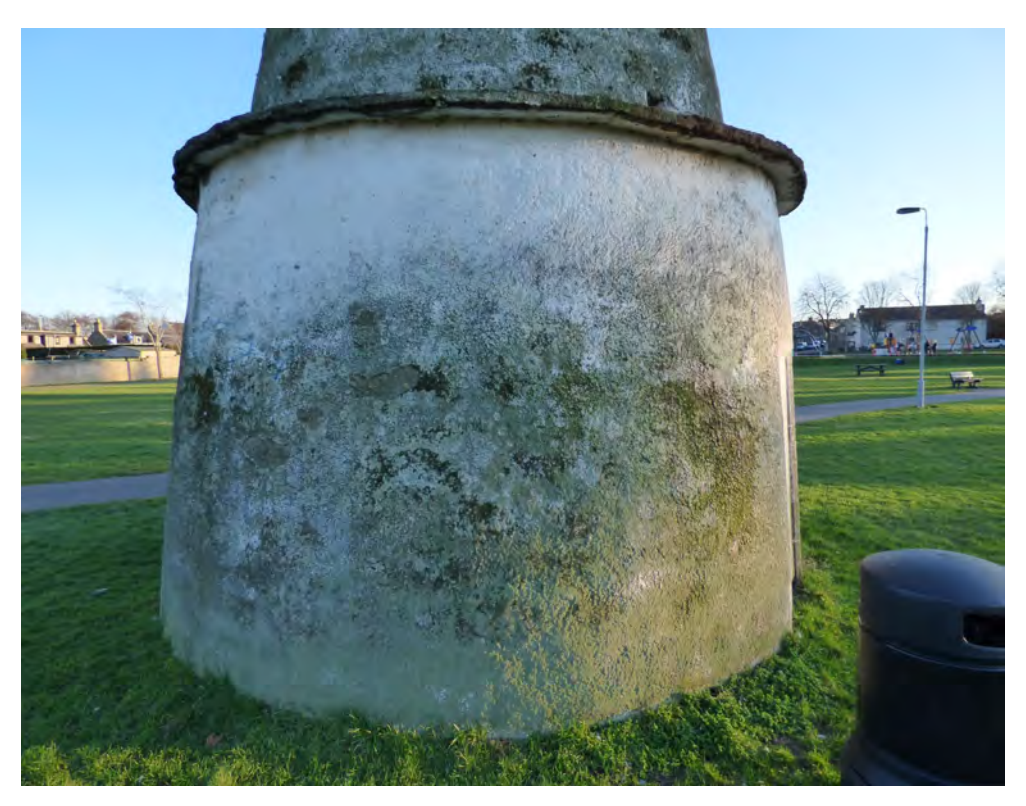
Figure 17.2 North side of the doocot showing the generally sound condition of the harl.