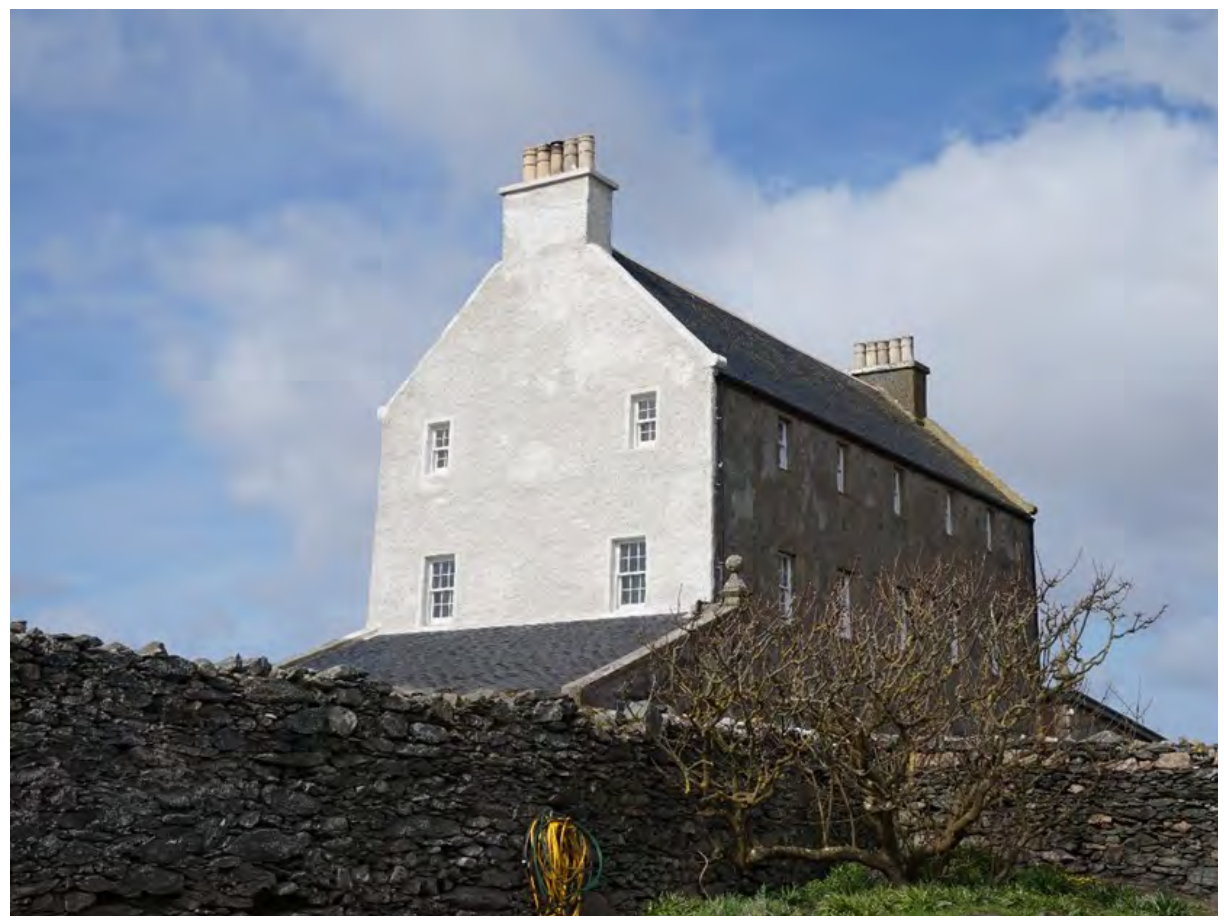
Figure 21.1 South-east gable and north-east principal (front) elevation.

Haa of Sand is constructed of local granite with sandstone ashlar dressings. The principal elevations are currently finished with a lime slaister pointing with extensive cement based repairs. Prior to the reharling of the south-east gable in late 2014, the gables were both finished with a cement based roughcast. The re-harling works were supported by funding from Historic Environment Scotland and the Shetland Amenity Trust.