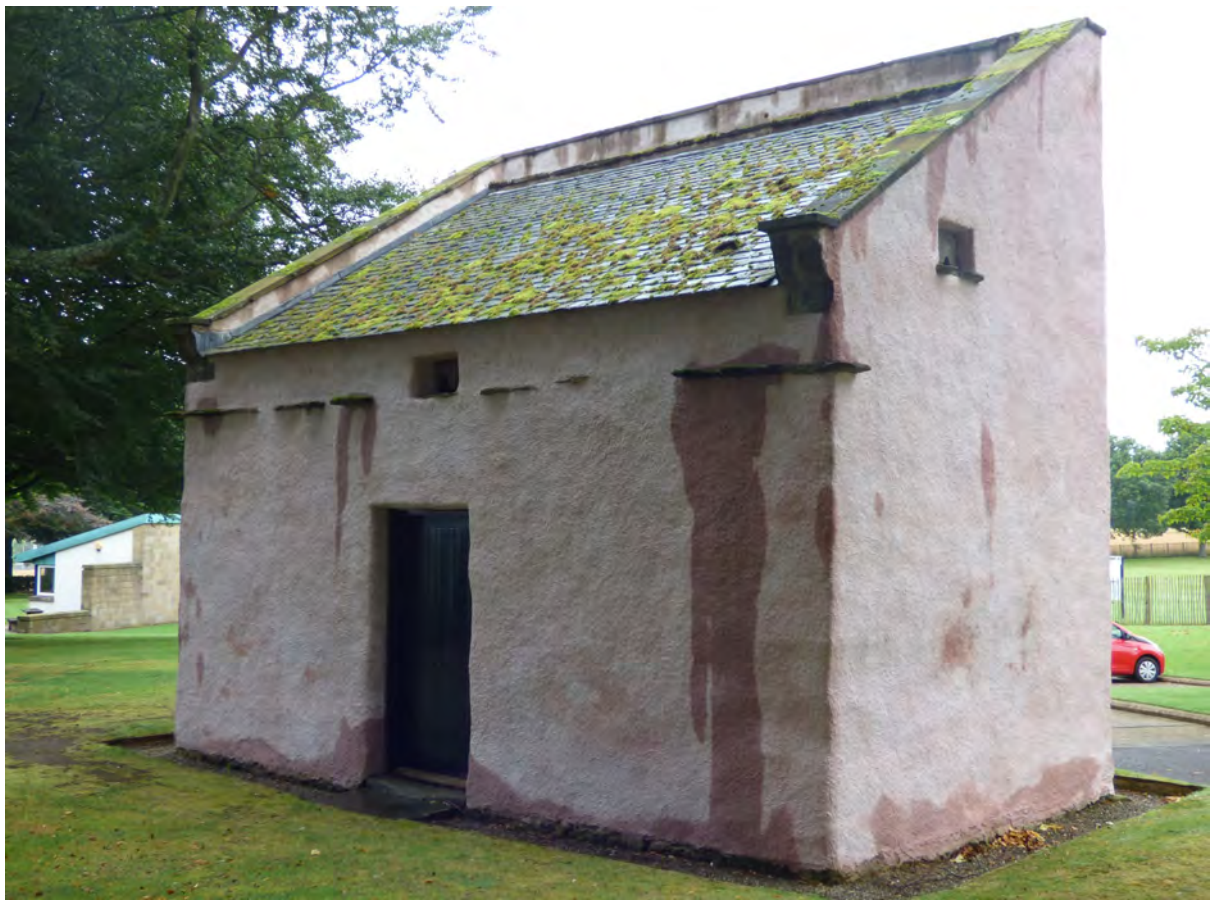
Figure 18.1 General view showing the front (south) elevation; photo taken after heavy rain.

The harling on this structure appears to be a hand-cast finish, limewashed. It was inspected immediately after a spell of heavy rain, which allowed easy identification of areas of run-off and staining. It is understood that the existing harling is an NHL gauged hot-mixed mortar and was applied in 2011, replacing an earlier defective lime harling. The harling and limewash are in generally good condition. Roof copes to the rear (north) wall seem to have open joints allowing water to drain into the parapet upstand. The perpend joints to the copes on the side (gable) elevations appear to have open joints leading to water accessing the wall head and channelling water flow over the harled surface below.