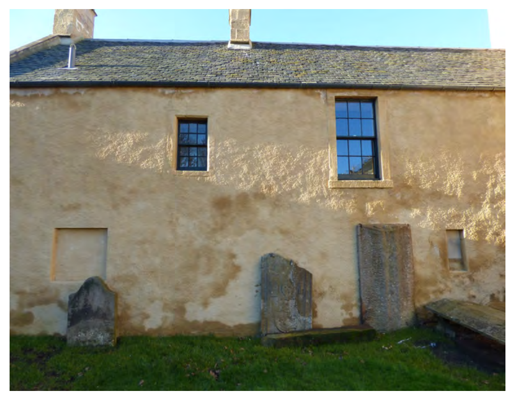
Figure 7.3 East elevation, which is generally in a sound condition, with localised discolouration of the harl, again due to both rising and draining dampness and the drying of the wall fabric below.