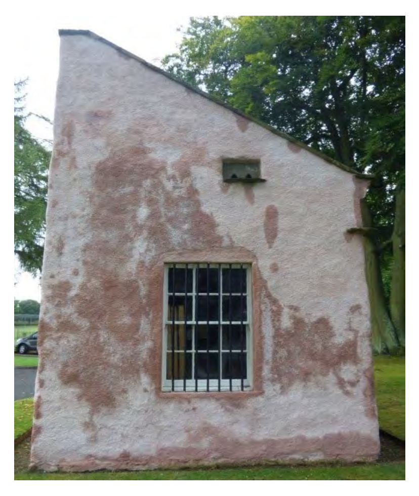
Figure 18.2 View of the west gable, showing extensive discolouration. This is mostly due to insufficient overhang on the skew cope above, and wind driven rain having recently played on the surface.

Cracking, similar to that seen on some cement renders, is apparent in the harling on the rear (north) elevation and on the east side. This may be a combination of reflective cracking from the masonry below and shrinkage/thermal cracking in the harl. Such a fine matrix of cracks indicates a hard finish, possibly with a higher than normal hydraulic component not giving much flexibility.