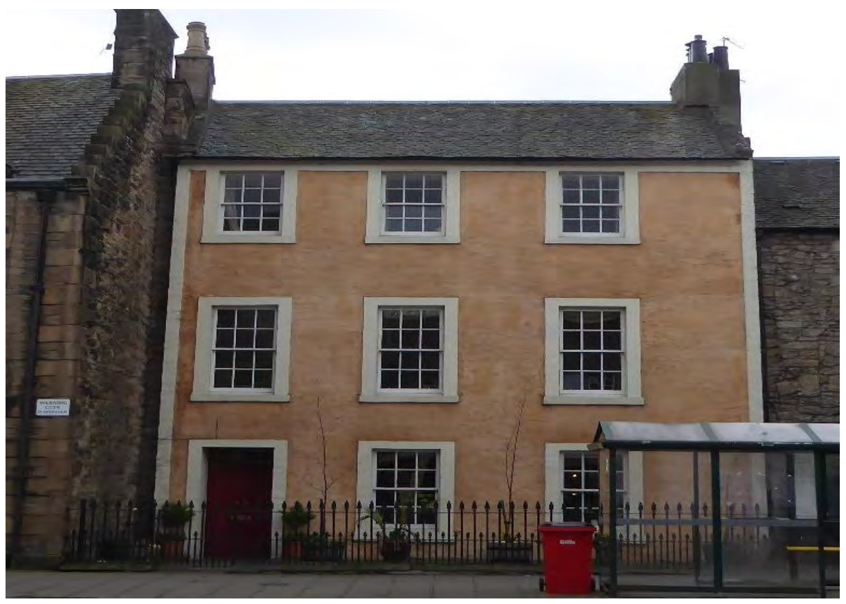
Figure 23.1 View of the front (north) elevation.

The front (north) elevation of this building has been harled and limewashed. The harling is reported to be an NHL gauged hot-mixed lime mortar. The harling has been finished with a pigmented limewash and the window margins appear to have been painted with a mineral paint. From the appearance of the harl, and the regular horizontal pattern apparent, it is considered that the harl had either been applied with a harling gun or sprayer. There are also features apparent that may suggest some localised flattening or re-spreading of the harl whilst still plastic at the time of application, with the mortar being applied relatively wet (workable).