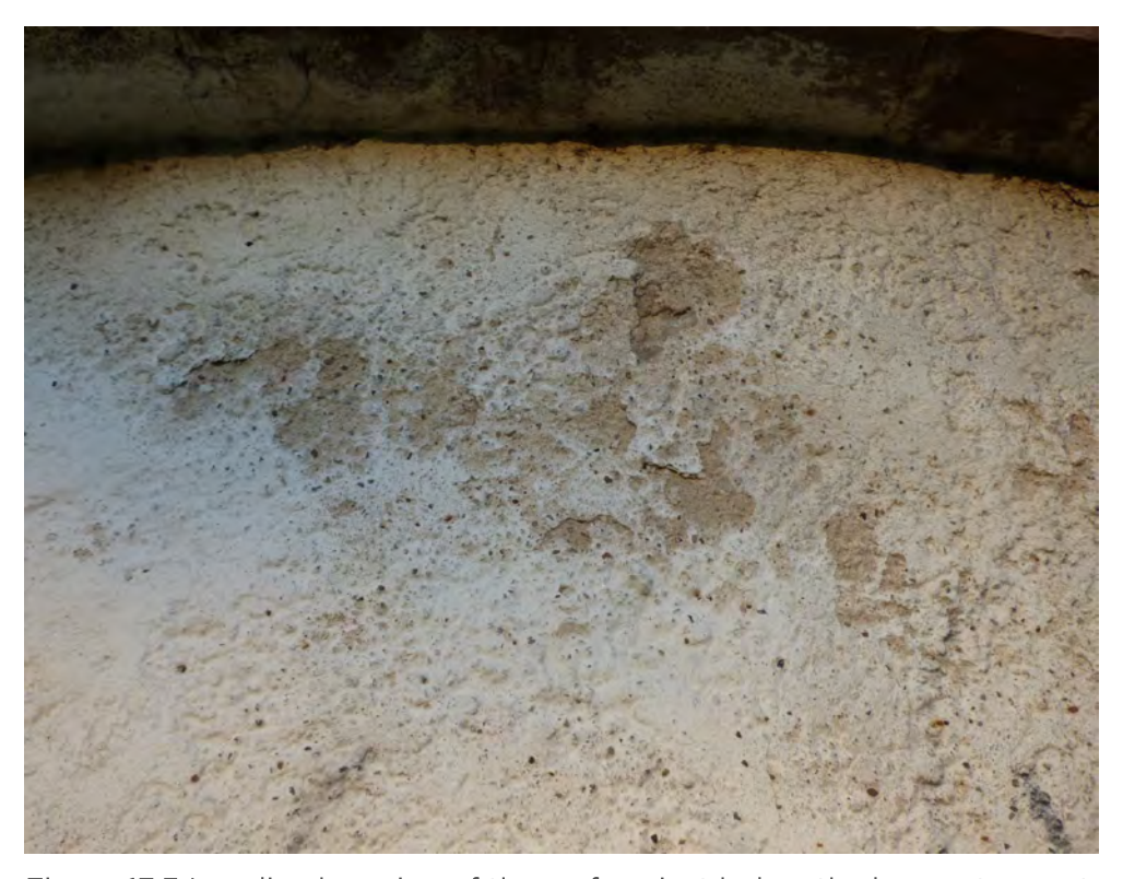
Figure 17.3 Localised erosion of the surface just below the lower stone rat ledge on the west side.