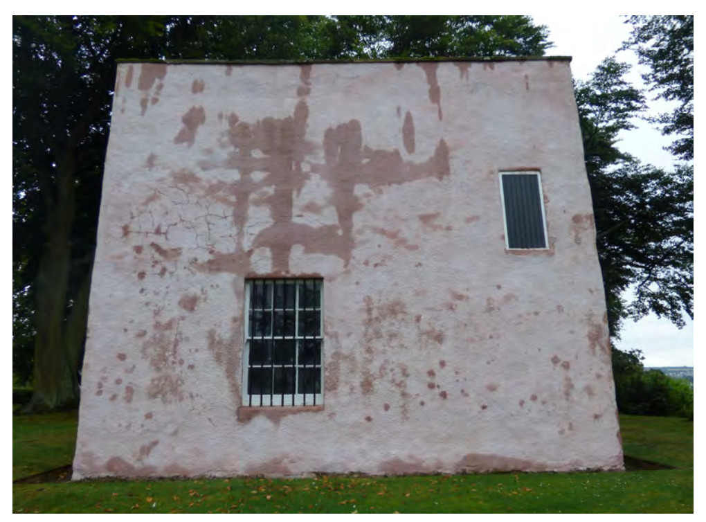
Figure 18.3 Rear (north) elevation, where the narrow overhang on the wall head cope is insufficient to keep water off the wall.