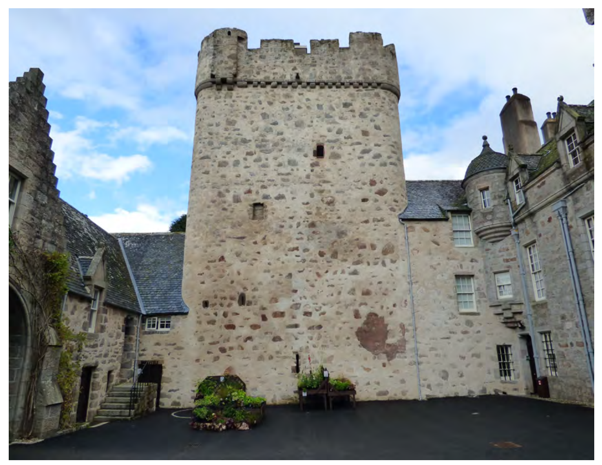
Figure 4.1 North elevation of the tower.

The work on the tower were supported by the Annual Repair Grant given by Historic Environment Scotland to the National Trust for Scotland. Although the building does not have a full harling, the tower at Drum Castle was repointed, fully-flush (or slaister), using an NHL gauged hotmixed mortar and given a scraped finish. On the north elevation, the mortar appears generally well bonded and there is good adhesion between the stone and the feathered mortar edges. The patchy appearance of the mortar, observed on all elevations, is possibly due to the poulticing effect of the lime mortar drawing moisture (and salts) from the underlying saturated wall fabric. There has been a long history of damp in this building, and although this is now understood to have been addressed, there is an expectation that the substantial thick masonry walls will take many years to dry out. In the meantime, the poulticing effect of the external lime work, replacing much of the previous cement work, will inevitably impact upon the appearance and durability of the external lime work.