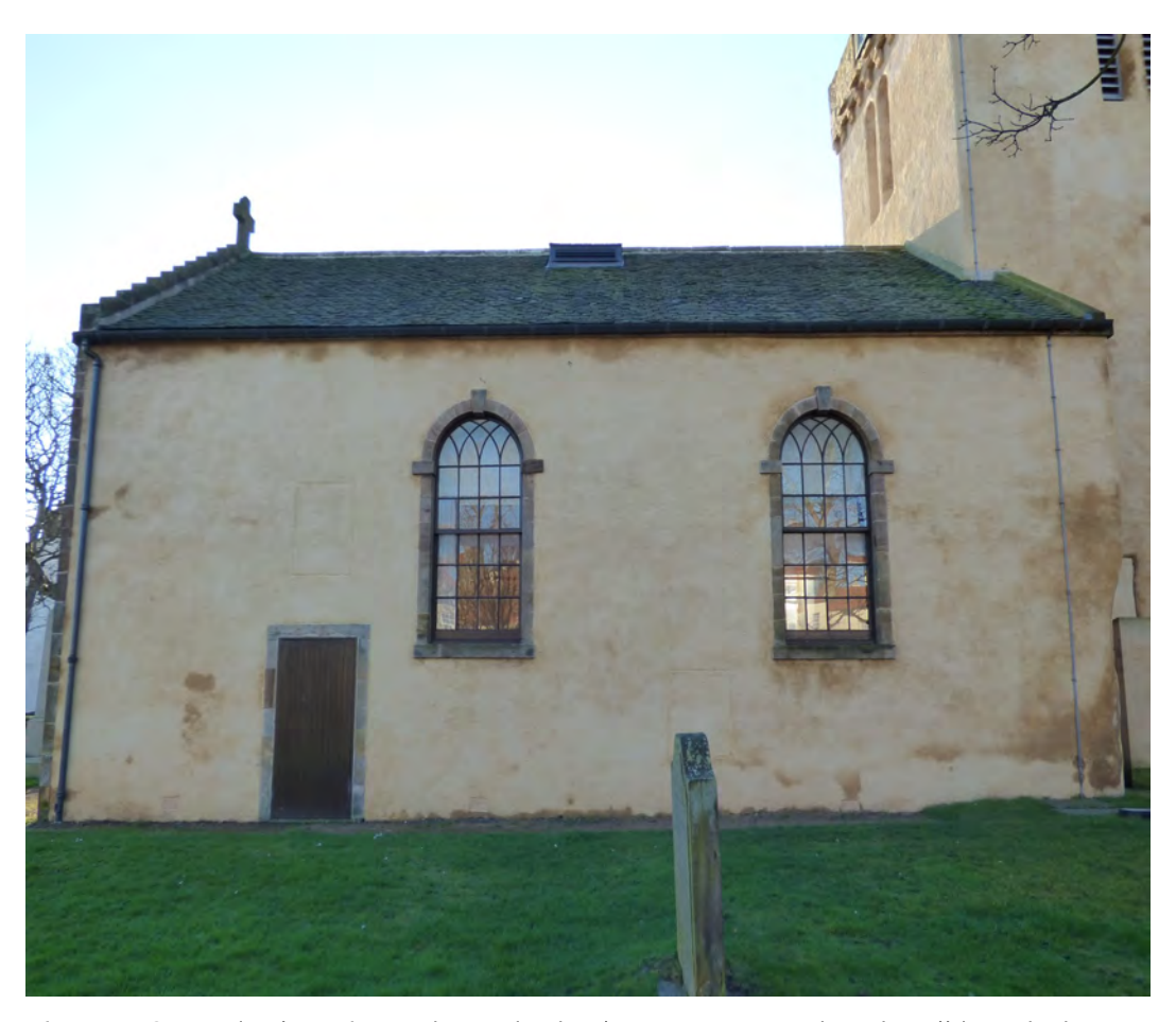
Figure 7.2 North elevation, where the harl appears sound and well bonded. Localised discolouration seems to be due to water run-off and from drying of the previously saturated walls.

The harling and limewash on the south elevation (east end) of the church is suffering from a previous defect with the roof gutters. Channelled water flow down the wall face has resulted in erosion and damage to the harling. A similar pattern, but with a lesser degree of damage to the harling, can be seen to the west end of this elevation. However, the rainwater goods on this elevation appear to have been modified, possibly resolving the problem.