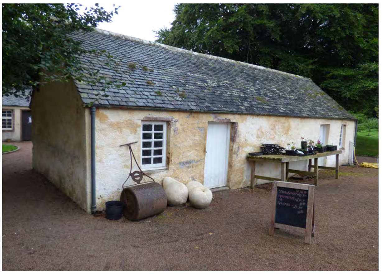
Figure 5.1 Front (north) elevation, viewed from the north-east.

The building is constructed from sandstone rubble finished with a lime harl which has been limewashed. It is understood that an NHL gauged hot-mixed mortar was used for the harling. The work was supported by Historic Environment Scotland's Annual Repair Grant to the National Trust for Scotland. From tapping the coating and visual inspection, the harl appears to be generally sound and well bonded to the substrate. However, adjacent to the openings there is local damage from impact and abrasion; water damage has arisen from faulty rainwater goods and rising damp or water splash against the walls.