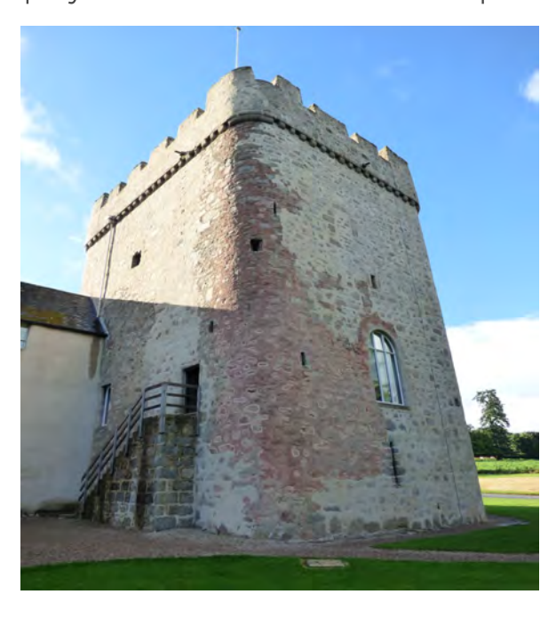
Figure 4.2 View of the south-west faces of the tower, affected by localised cracking and spalling of the mortar.

Part of the west wall has all the typical features of wet mortar affected by frost damage, causing failure. The leaching shows that the wall is still wet. This may be a consequence of poor parapet drainage or water being played down the wall from the spouts above.