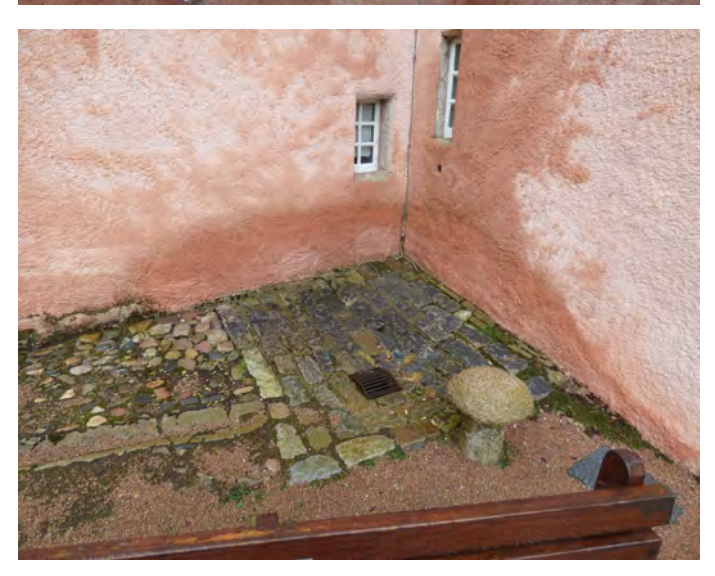
Figure 3.4 Impact of water discharged from the high level area.