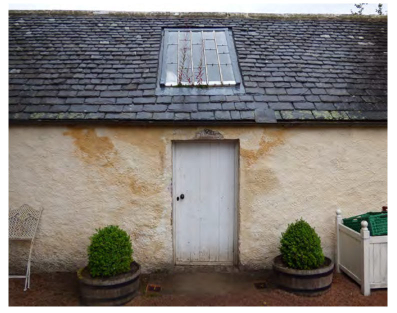
Figure 5.3 Rear elevation, with discolouration and some spalling from water damage. This is possibly caused by rainwater overtopping the gutters below the large rooflight.