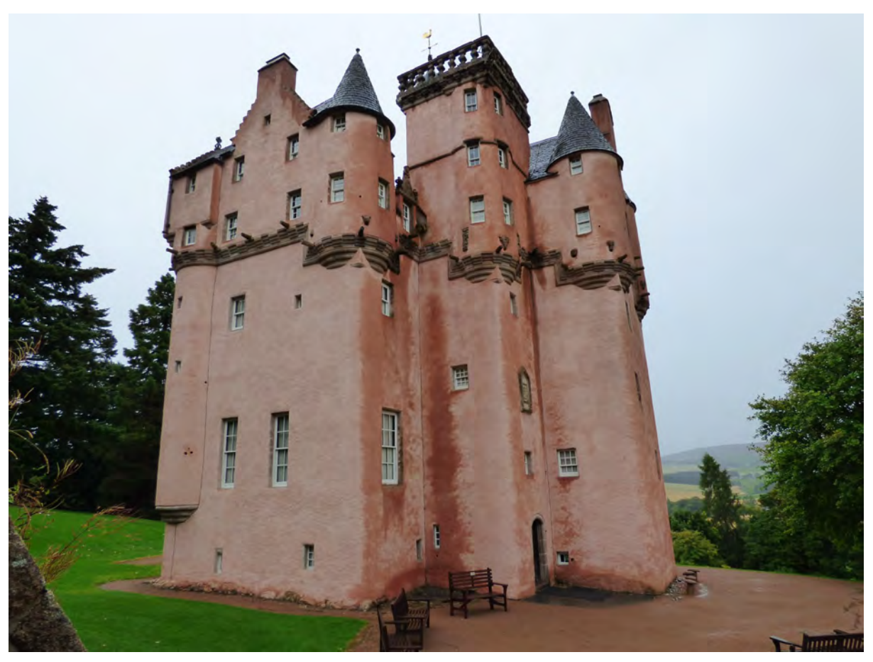
Figure 3.1 View from the south after a period of heavy rainfall.

The work to the castle were supported by Historic Environment Scotland's Annual Repair Grant to the National Trust for Scotland. The harling is an NHL gauged hot-mixed mortar, limewashed. The lime harling and pigmented limewash were applied during 2009-10 to replace a previous cement based harling that had been put on in the 1970s. The lime harling is all hand-cast. The harling and limewash appear to be performing well, with the exception of localised areas affected by moisture, principally rainwater run-off and splash back. Rainwater can be observed draining off the high level detail, and from the water spouts at the upper string course. Some of this water is being blown back onto, and draining down, the face of the harling. This is resulting in saturation of the harl and limewash, localised erosion of the limewash, soiling and algae growth.