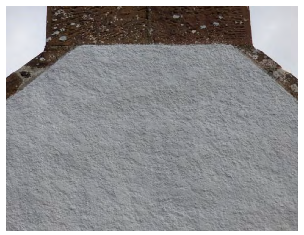
Figure 11.2 Close-up of the harling termination at the chimney.