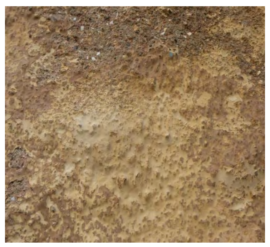
Figure 24.3 Close-up of an area of harl which has suffered from localised erosion, showing the range of limewash coats and the crushed shell.