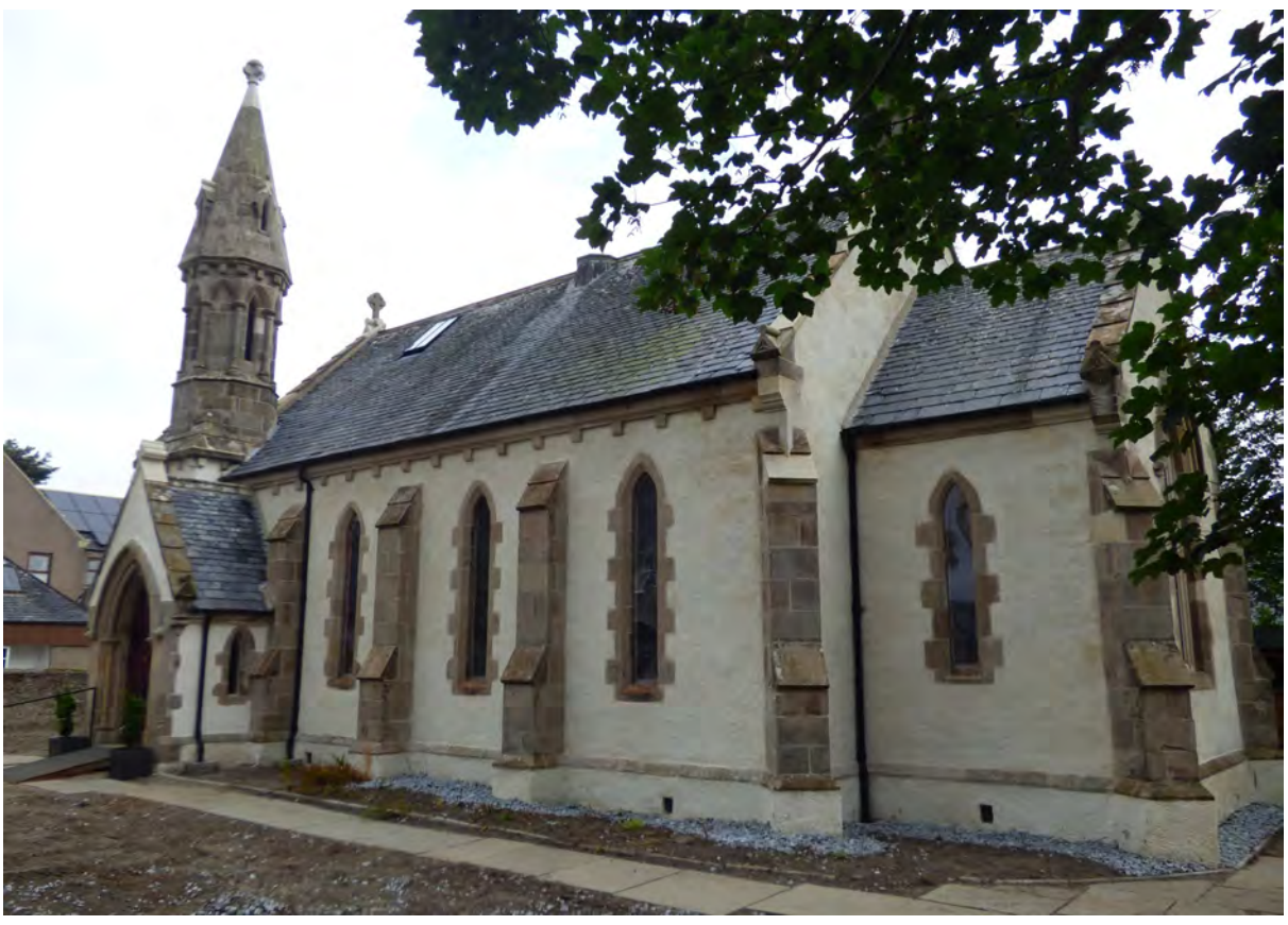
Figure 2.1 The front elevation, viewed from the south-east.

The work here were supported by a grant from Historic Environment Scotland. The building's harling is applied to the front, gable (side elevation), rear elevation (east side) and rear recess. It is an NHL gauged hot-mixed mortar, and a traditional hand-cast finish throughout which is consistent in terms of its texture and general appearance. It is finished with a limewash which also seems consistent in terms of its colouring.