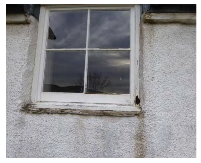
Figure 12.2 Window on the south elevation. The flaggy stone cill is deteriorating, as are all cills on this elevation, with a crack on the east side of window. Although there is evidence of channelled water flow over the cill, the underlying harl is sound and the limewash in relatively good condition.

The east gable appears to be the most protected from the weathering and as such is in very good condition. The west gable, being the most exposed to the weather, has lost much of its limewash finish. This is likely due to wind and rain abrasion, however, it should be noted that the underlying harl appears sound.