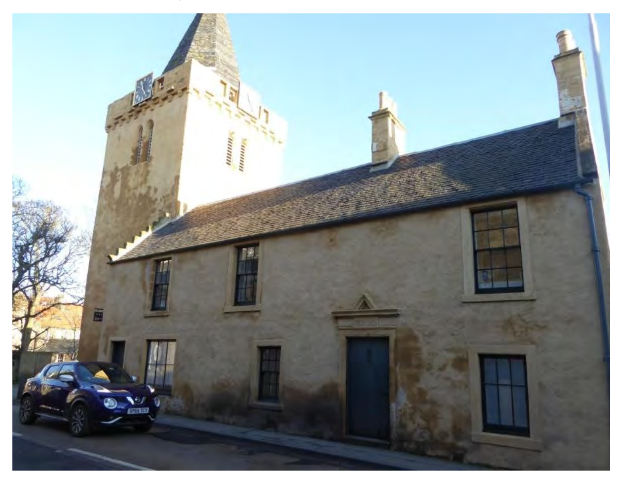
Figure 7.1 The front (west) elevation.

Client: Anstruther Improvements Association