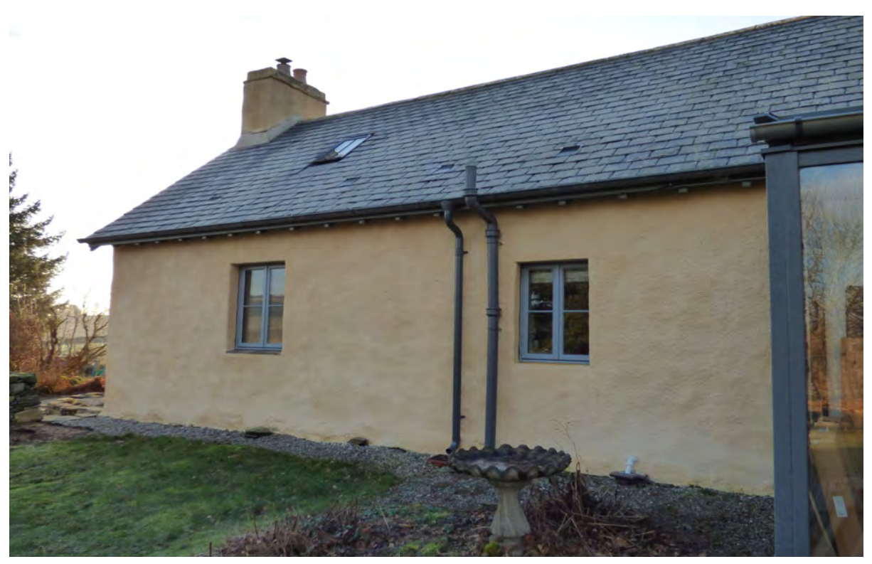
Figure 14.2 North elevation, west side. The harling is slightly textured and undulating following, to some degree, the profile of the masonry.