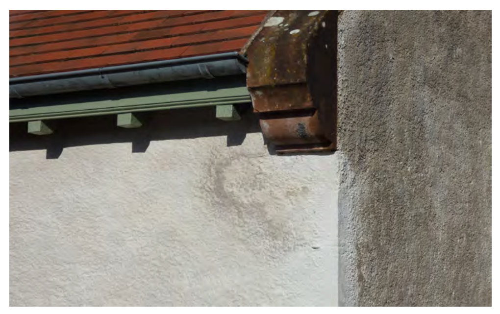
Figure 20.2 View of the skew putt on the south-east corner, which shows some minor staining of the limewash due to water run-off from the skew putt.

There was no access to the west gable or rear (north) elevation on the day of the site visit.