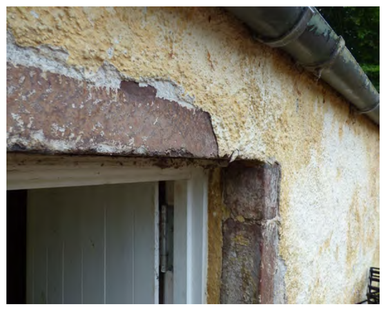
Figure 5.4 Loss of harl from the lintel and the sandstone dressings to the ingo at the east doorway on the front elevation.