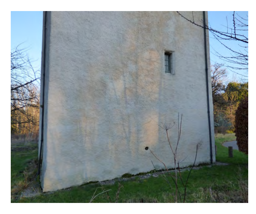
Figure 16.3 Base of the south-west elevation showing the harling and limewash to be in good condition.