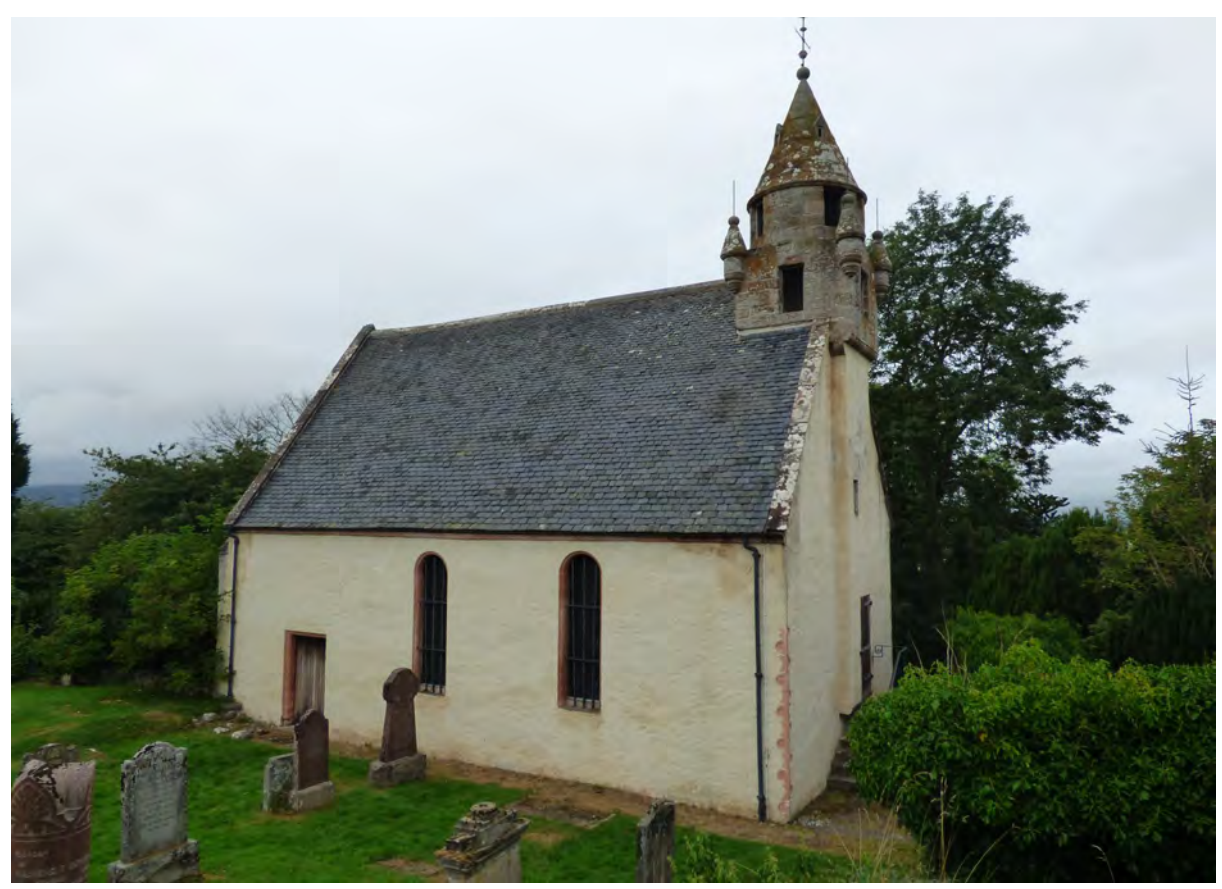
Figure 15.1 General view of the Wardlaw Mausoleum, viewed from the south-east.

The Wardlaw Mausoleum originally dates from the early 17th century. It was refurbished between 1997-98 and the harling was repaired as part of these works. The works were supported by grant funding from Historic Environment Scotland. Existing lime harling was patched with new matching lime harling, all of which was then limewashed. The building has not been limewashed since. The new harling and patch repairs were composed of a lime putty: sand coarse stuff to prepare backgrounds, and a hot-mixed coarse stuff for the harling; both mixes were gauged with an NHL. The quicklime for the harling was locally sourced and burnt on site in a small kiln. The sand for the harling was sourced from a local river bank. The hot-mixed mortar component was used cold after maturing on site for a few weeks. A hot-mixed grout (used hot) was also used to fill and consolidate areas of wallhead.