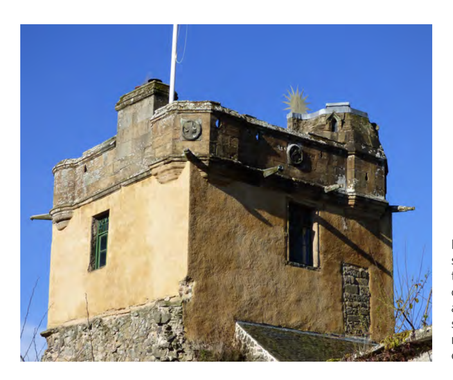
Figure 9.2 View of the south-east corner, with the localised area of disrupted harling apparent just below the string course on the north side of the east elevation.

Localised cracking in the mortar jointing to the chimney masonry was observed on the north and south elevations. This appears to be allowing water ingress into the wall fabric that is percolating down onto the harl on the south elevation, below the parapet level. However, this has reportedly only become apparent after the installation of a flagpole which was anchored against the east side of the chimney masonry, and it is considered that the cracking has been induced due to localised movement in the chimney masonry rather than as a deficiency in the harl itself.