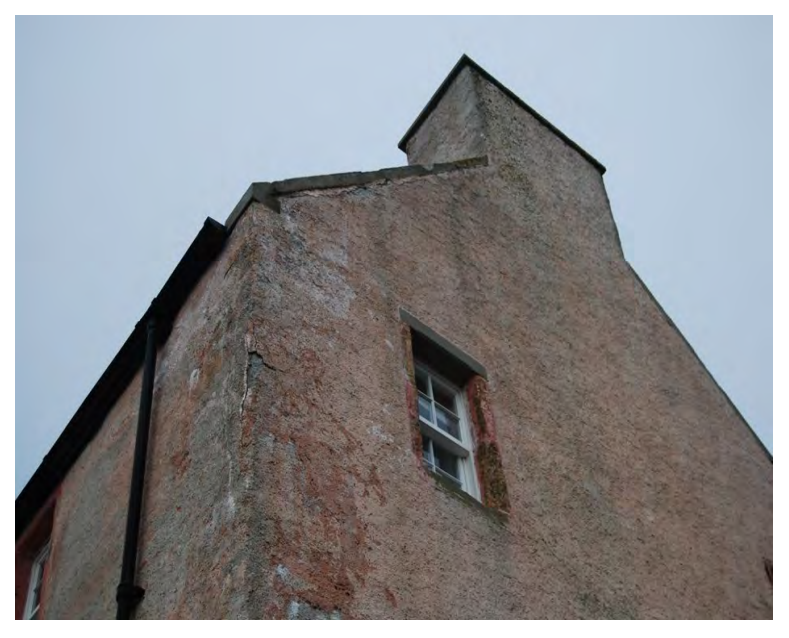
Figure 22.2 South-west corner illustrating a number of defects to the harling; cracking and localised detachment of harl, localised lime leaching and partial loss of limewash.

Some 15 years after the work was carried out, the harling remains largely intact, with the exception of an area below the skews to the south-west corner which is cracked and shows localised detachment. It is understood that the building has not been re-limewashed, or the harling otherwise maintained, since the work was completed in c.2002.