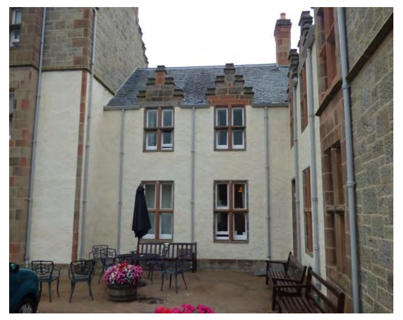
Figure 1.2. Harling to the front elevation, east side of the tower. The harl and limewash all appear to be uniform and in a sound condition.