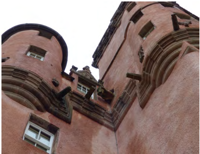
Figure 3.3 View of water spouts at third floor level all contributing to water discharge that is impacting on this corner at ground level.