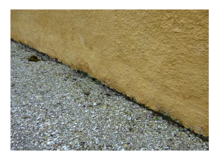
Figure 10.3 View of harl close to ground level. The harl has been terminated just above ground level to minimise wicking.