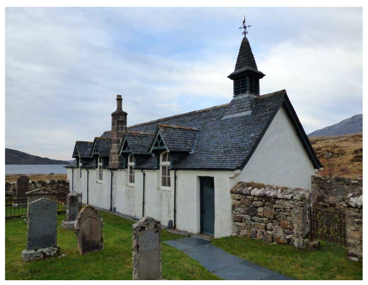
Figure 12.1 Front (south) elevation.

Date of works: c.2003 Client: Historic Assynt