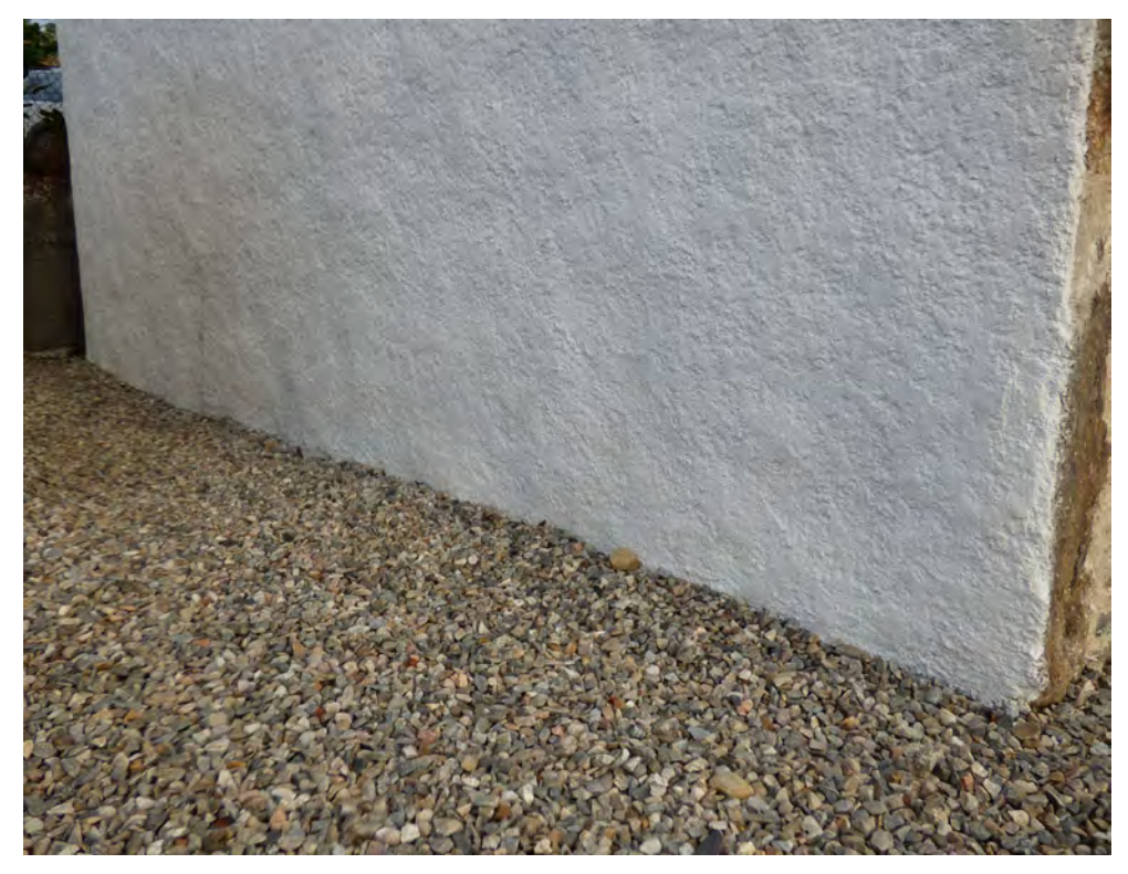
Figure 11.3 Base of the wall, showing harling carried on down to ground level.