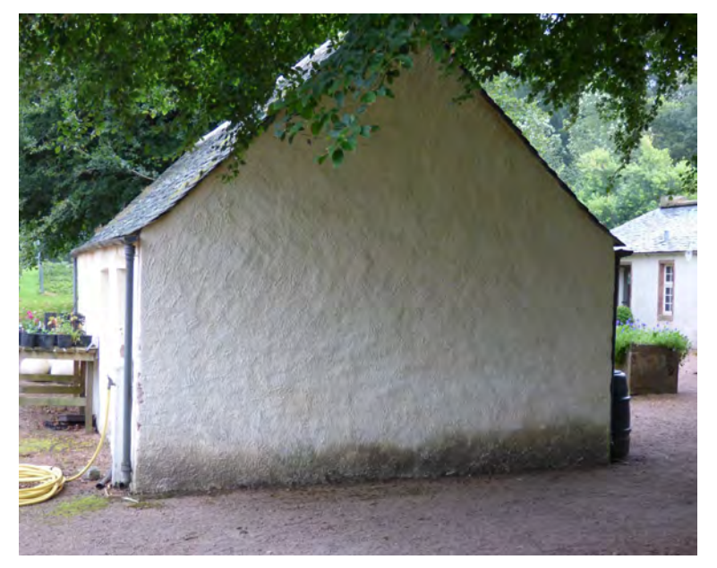
Figure 5.2 West gable, with the limewash and harling over most of the wall area in good condition. The exception is at ground level which is marked by soiling and wetting due to long term splash back from rainwater dripping from the roof.