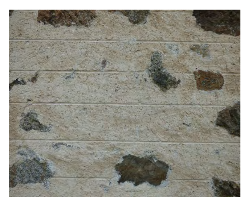
Figure 13.2 Close-up of an area of the pointing, showing a generally tight finish with a relatively uniform texture and finish.

However, generally the pointing was well executed and is performing effectively. In particular it was observed that the junction between the mortar pointing and the granite stone was tightly sealed with no evidence of cracking. This indicates the effectiveness of a hot-mixed mortar in forming a successful bond with a hard stone type.