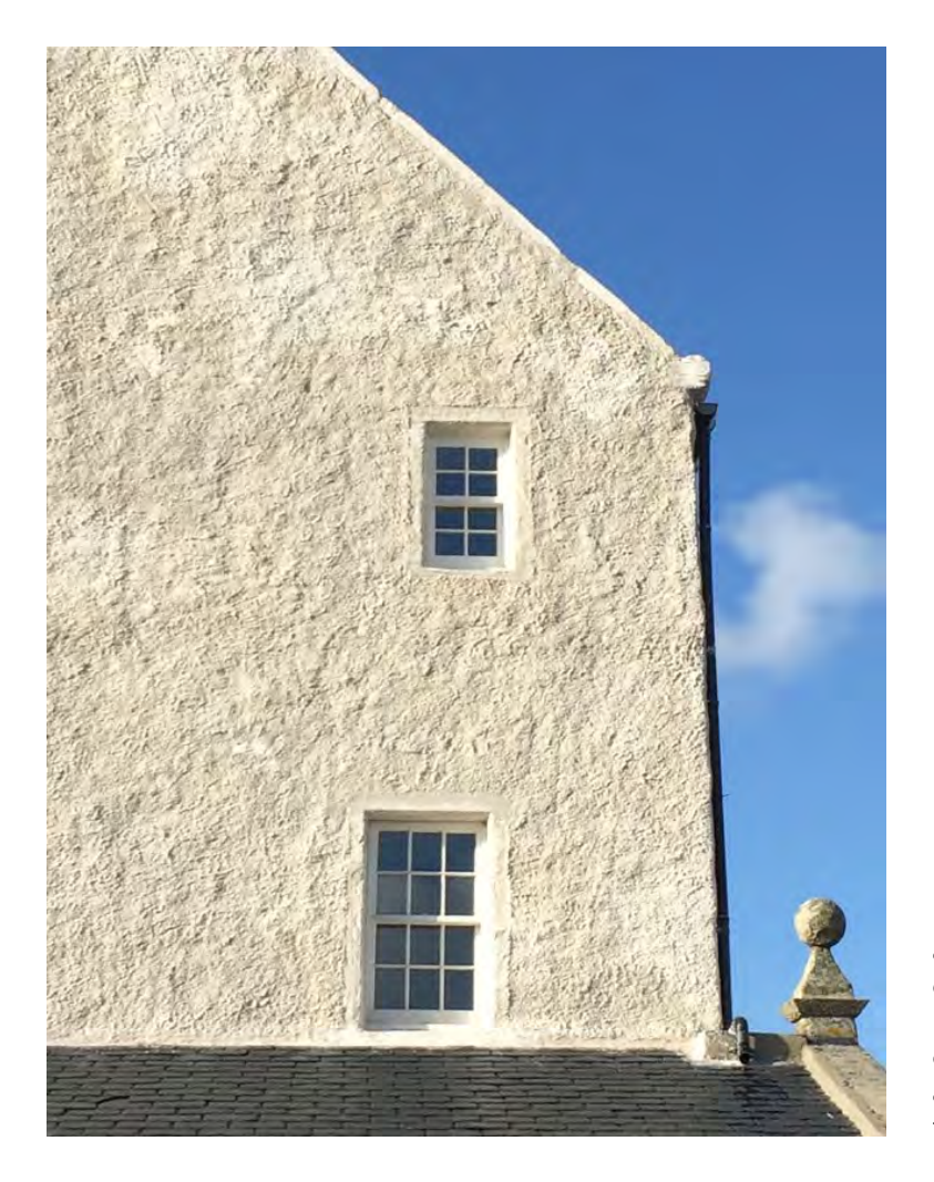
Figure 21.3 Detail of harling and limewash finish to southeast gable elevation, illustrating the textural effect of the harl in direct sunlight and the colour variation due to wetting and drying.