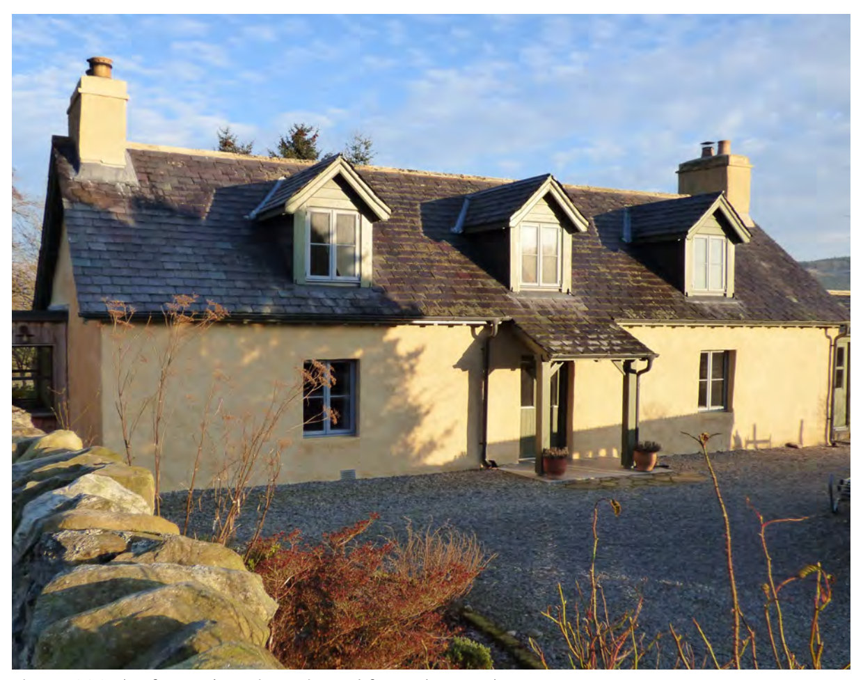
Figure 14.1 The front elevation, viewed from the south.

The cottage is constructed of traditional rubble stone bedded in clay mortar, pointed and newly harled and limewashed. The harling is an NHL gauged hot-mixed mortar with a pigmented limewash. It is understood that a more robust mortar mix based on an NHL: sand mix was used on the chimneys due to the higher degree of exposure at roof level. The limewash finish was reported to consist of two coats of white and three to four coats of pigmented limewash.