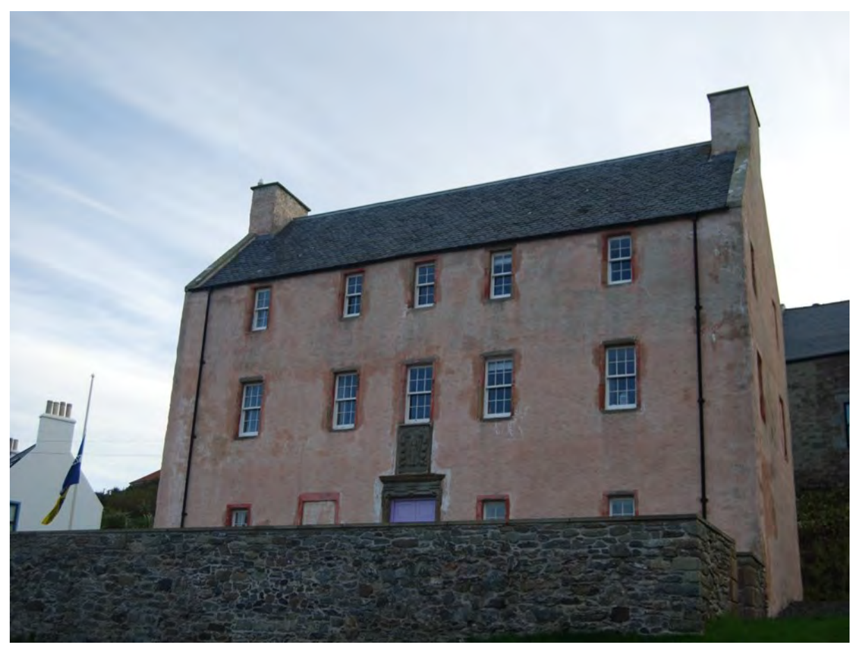
Figure 22.1 Front (west) elevation of Haa of Scalloway.

Haa of Scalloway is constructed of rubble masonry (mixed stone types), bedded in earth/clay based mortar and finished with a protective harling.