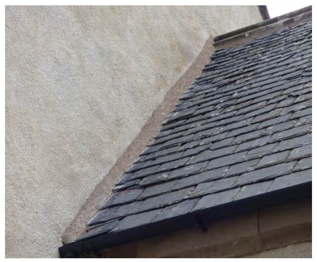
Figure 2.3 Slight patchiness was observed on the east gable, which is not uncommon in limewashed harl, particularly following periods of rainfall and subsequent drying.