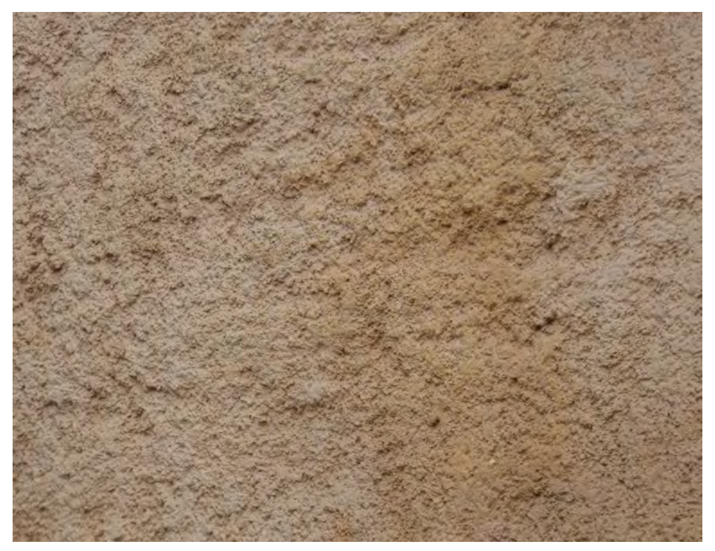
Figure 23.3 A close-up of the harl and limewash finish showing the aggregate distribution across its surface. The more open texture may be indicative of a mechanically applied harling.