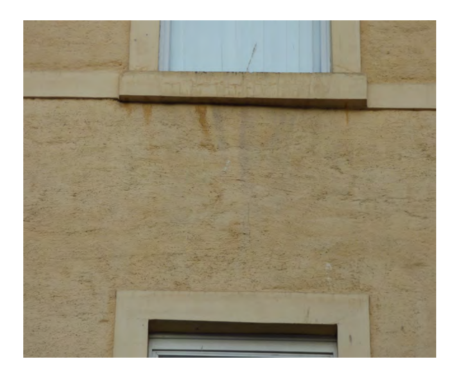
Figure 6.3 View of harl just above a first floor window, some faint horizontal cracking and discolouration of the limewash below the cill can be seen due to water draining over the cill.