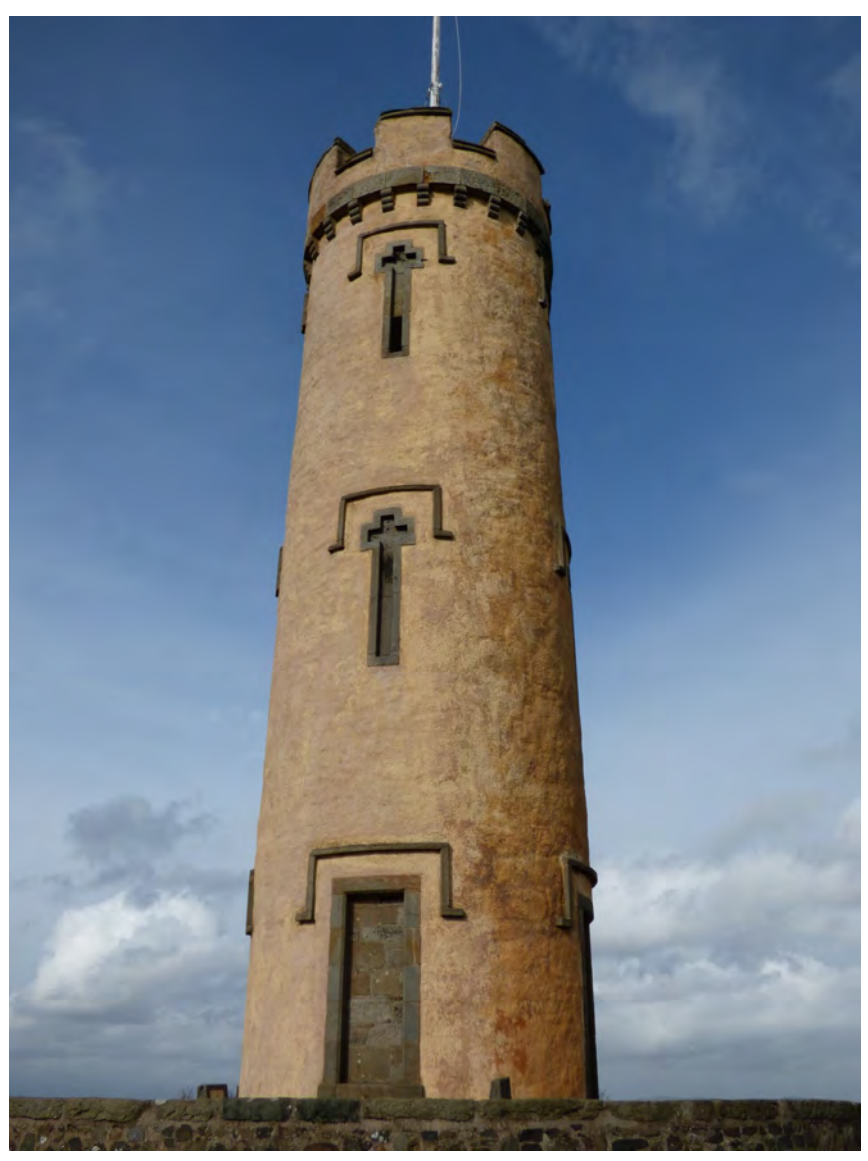
Figure 24.1 View of the tower from the east.

The tower of the House of the Binns is a round tower constructed of rubble with sandstone dressings. The tower was repointed and harled with an NHL gauged hot-mixed lime mortar as part of major repair scheme. The scheme was supported by Historic Environment Scotland's Annual Repair Grant to the National Trust for Scotland. The limewash used at this stage was mixed with linseed oil and later coats have been added. The limewash is pigmented and there were at least four coats of various colours observed in areas where the limewash and the surface of the harl have been locally eroded. It was also noted that the aggregate used in the harl contained shell and it is understood that this was added as part of the aggregate component of the mortar.