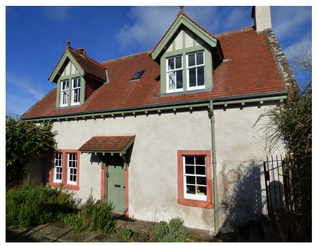
Figure 20.1 Front elevation of the cottage.

The cottage's harling is a traditional hand-cast finish with a subtly pigmented limewash applied over it. It is understood that an NHL gauged hot-mixed mortar harling was used. Generally the harling and limewash are doing well. At the base of the front elevation there are indications of rising damp up to 300mm from ground level. Moisture was also observed in the harl adjacent to the east downpipe, possibly indicating a current or past blockage in the downpipe.