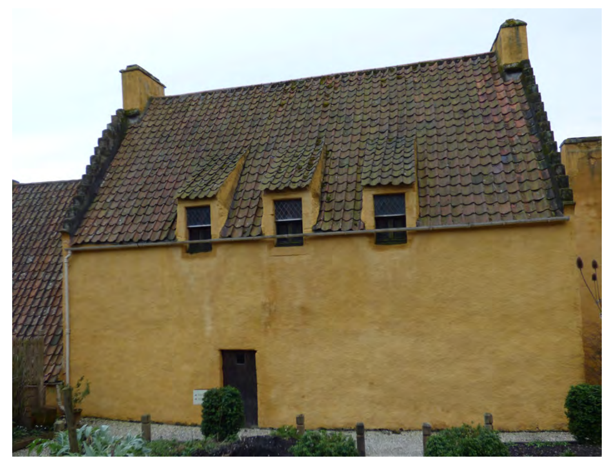
Figure 10.1 View of the north range, rear elevation.

The north range of Culross Palace was harled in an NHL gauged hot-mixed mortar. The works were supported by the Annual Repair Grant given to the National Trust for Scotland by Historic Environment Scotland. The harling has been limewashed with a pigmented limewash. On these elevations, the harl has the appearance of a traditional hand-cast application that has been lightly pressed back, producing a tight, relatively uniform surface texture. It is visually uniform and appears to be well bonded to the substrate.