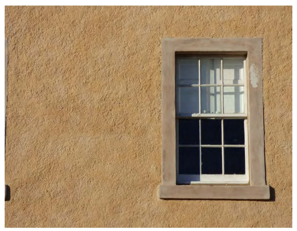
Figure 8.2 View of an area of harl, to the west of the easternmost window, at first floor level. Here the subtly undulating profile and texture of the harl can be seen to be enhanced by the warmth of the limewash coating.